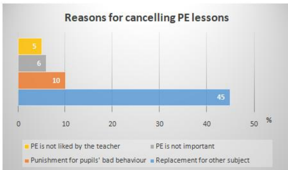
Fig2. Reasons for cancelling PE lessons by the teachers

surprising that almost 10% cancel PE lesson, because they want to punish the pupils for bad behaviour. The PE lesson is mostly the most favourite subject of pupils and therefore this punishment is seen by the teachers as a good choice (fig. 2).