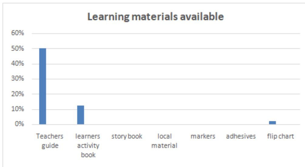
Figure2. Learning materials