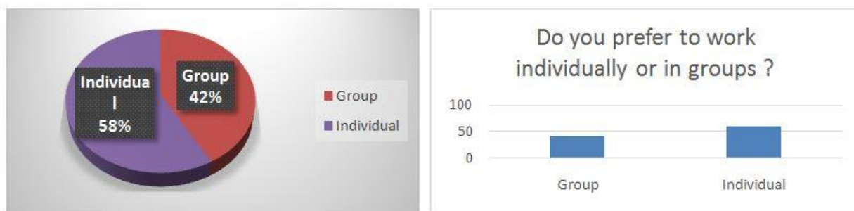
Picture1. Do you prefer to work individually or in groups ?

From the data obtained, the students' responses turned out to prefer learning that focuses on teacher centered. The percentage obtained is 71% for those who choose teacher centered and 29% for those who want student centered. From this it can be concluded that English students prefer a way of learning that focuses on the lecturer or teacher who explains the learning material and students are more passive.