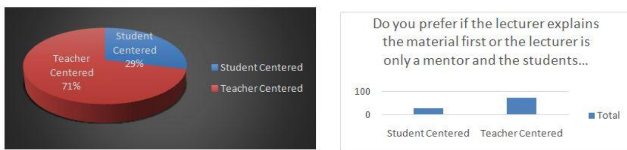
Picture2. Do you prefer if the lecturer explains the material first or the lecturer is only a mentor and the students more active ?

From the data obtained, the students' responses turned out to prefer learning that focuses on teacher centered. The percentage obtained is 71% for those who choose teacher centered and 29% for those who want student centered. From this it can be concluded that English students prefer a way of learning that focuses on the lecturer or teacher who explains the learning material and students are more passive.