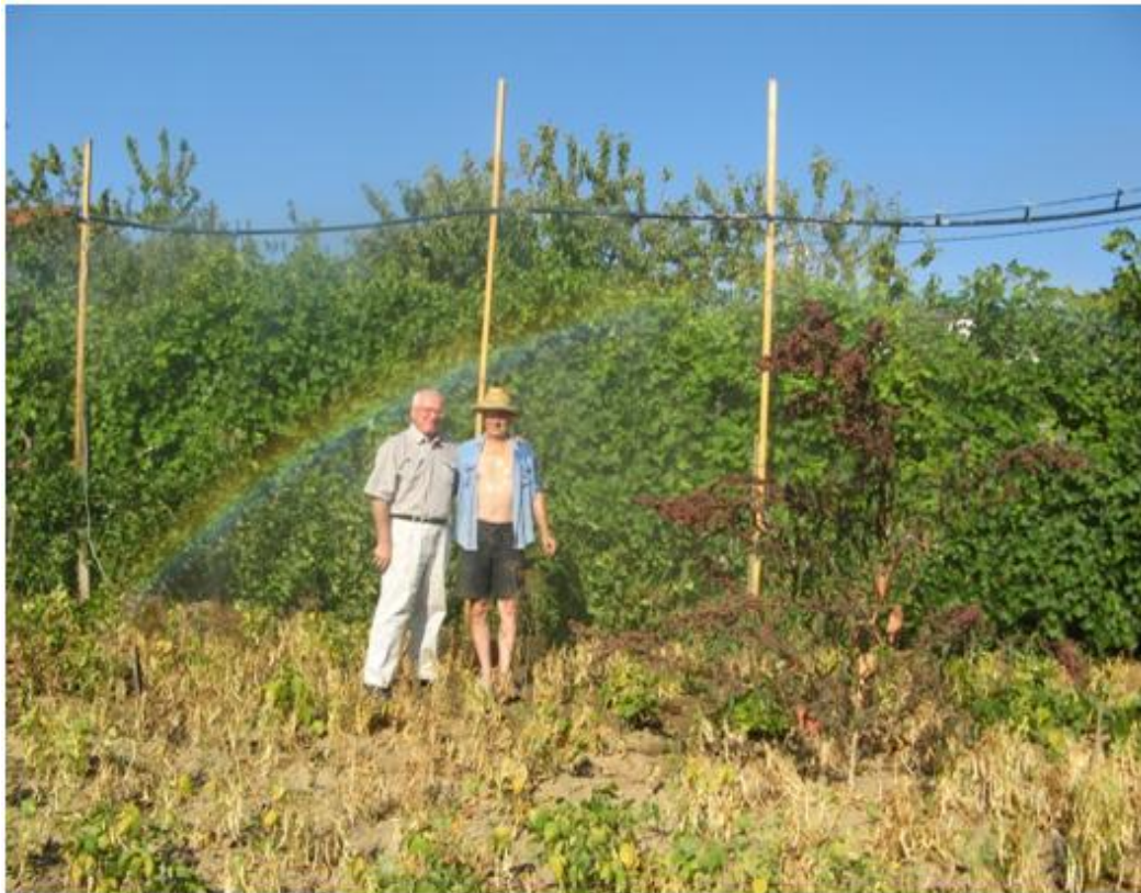
Picture1: The authors I.G. (left) and I.D. (right) in front of the rainbow in the garden of I.D.

With such an installation we obtained a rainbow from Picture 1.