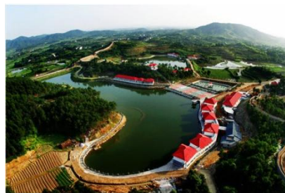
Figure10. Qichun Country Tam Giang Resort And Spa