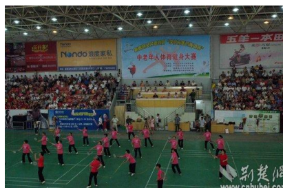
Figure2. Qichun Country Middle and Aged Sports Fitness Contest