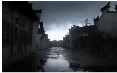
Figure6. Qichun Country Qizhou Studio City