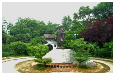
Figure5. Qichun Country Li Shi-Zhen Cemetery

Watching types of sports tourism resources: Qichun country sightseeing types of sports tourism resources are rather rich, now the developed ones are Li Shi-Zhen cemetery, Qizhou studio city, automobile site cross-country championships, cultural square and so on(as Figure 5-8):