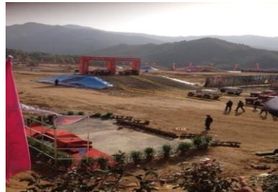
Figure7. Qichun Country Automobile Site Cross-Field Championships