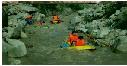
Figure3. Qichun Country South Milky Way Drifting