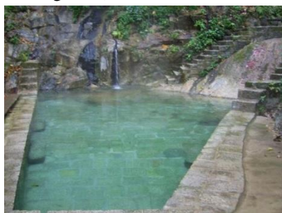
Figure1. Qichun Country Tongzi Hot Spring

Fitness types of sports tourism resources: So far, the fitness types of sports tourism resources that have been developed in Qichun are hiking, natural hot spring bathing, middle and aged aerobics contests and other items( as Figure 1, Figure 2):