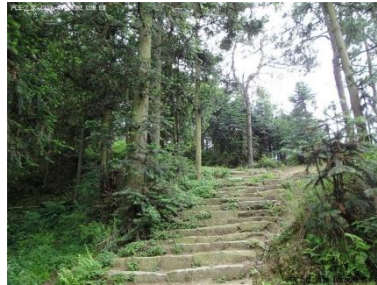
Figure9. Qichun Country Henggang Mountain Climbing

Leisure types of sports tourism resources: By far, Qichun country developed recreational types of sports tourism resources are mountain climbing, rowing, fishing, badminton, golf, square dance and other events(as Figure 9- Figure 10):