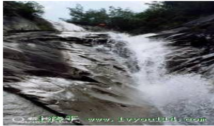
Figure4. Qichun Country Medicine King Valley Waterfall Falling

South Milky Way drifting scenic zone locates in Qichun country's Bluestone town, together with neighboring Taiping mountain villa summer resort, Tongzi hot spring relaxation, Medicine King Valley stream climbing, Wuma village exploration, White Cloud hole clouds viewing and others compose to an original ecological scenic zone that integrates relaxation, vacation spending, drifting and exploration. The full length of river way is nearly 4 kilometers; drifting time is one and a half hours. South Milky Way is the prototype of Tongtian River in Wu Cheng-en "Pilgrimage to the West", riding by rubber boat along cliffs and going downstairs, the sky is high and water is long, sun is shining over all the earth, green hills surround in all direction, drifting among them and you will find out a kind of rare excitement, a kind of unique feeling that is different from ordinary life in busy city life. Qichun is hometown of medical sage Li ShiZhen, where still kept lots of traditional ways of health care, especially was famous for medicated diet, medicated bath and so on, along with successful development of drifting, it let "medical sage hometown healthy cultural traveling" to be more perfect.