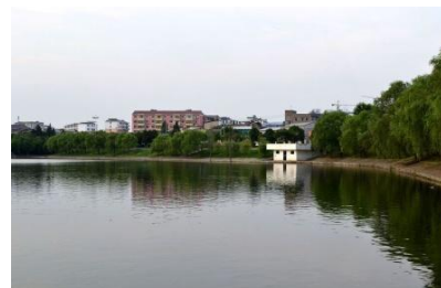
Figure8. Qichun Country Cultural Square

Li Shi-Zhen cemetery lies in the shore of beautiful scenic Rain Lake of Qizhou southeast, it covers an area of 80mu, which is composed of Li Shi-Zhen cemetery, Li Shi-Zhen memorial hall, Li Shi-Zhen medical history literature library and medicine garden four parts, is national key cultural relics protection unit. Memorial hall name is inscribed by comrade Deng Xiao-Ping, is architectural complex in ancient style in China(Ming Dynasty), quite splendid, well-proportioned, the engineering obtains “Luban Awards”, treasures domestic and international over ten kinds of “Compendium of Materia Medica” inside hall, and medical books, document literature and newspapers as well as periodicals that introduce Li Shi-Zhen at all times and in all over the world. And meanwhile it also is demonstration base of national patriotism education, which listed into “Qiyang eight views” in the ancient times, Li Shi-Zhen and his son’s original tombs and tombstone have been well preserved until now. Li Shi-Zhen medicine garden includes medicine stele corridor and Baicao garden two parts, which is Chinese first traditional Chinese medicine museum of Natural History. Chinese material medica inscription gallery inlays 128 pieces of medicine stone carving, carving is exquisite and true to life; Baicao garden plants over 310 varieties of medicines. Li Shi-Zhen cemetery, since it opened up in April, 1981, averagely received over 40 ten thousand Chinese and foreign visitors per year.