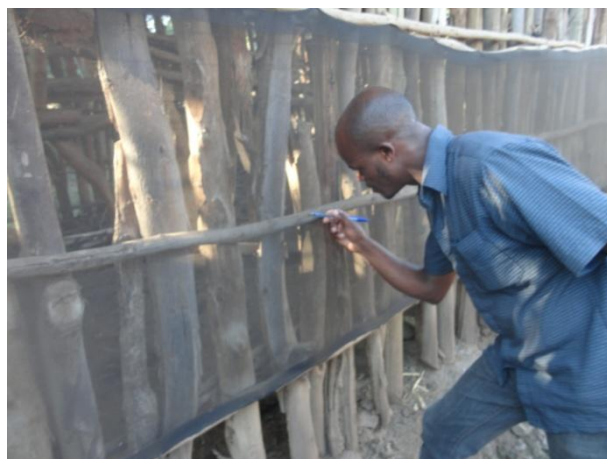
Figure. Experimental group

An experimental study was conducted to assess and check the effect of insecticide treated net on tsetse flies and other insects. During this experiment PCV values, defensive movements, milk yield and weight gain was measured for both experimental and control groups were used.