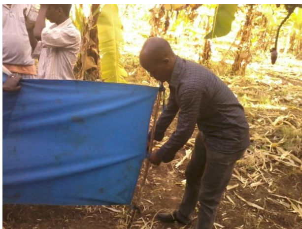
Figure2. NGU trap

Entomological monitoring was conducted to know the presence and densities of tsetse and other nuisance flies using 15 NG2G traps 10 for treated group and 5 for control group were baited with phenol and deployed at a distance of 5m away from treated and control pens. The attractant acetone was used by putting it under the trap stretched. The flies caught during the study were identified by and recorded. During this time 15 traps were deployed in shara kebele and flies were collected after 72hrs. The fly identification was based on their morphology of wing shape and their body size. The data collection was monthly. The pen allocated for the control group was left unfenced. The data obtained during the experiment was stored in the micro-soft excel spread sheet and the defensive movements, fly density, trypanosomosis prevalence, PCV, and persistence of the activity of the insecticide were analysed. The difference between experimental and control groups were compared to understand the effect of the deltamethrin-treated screen/net on the density of tsetse flies, tabanids and other nuisance flies around the pen(Machado A, 1954).