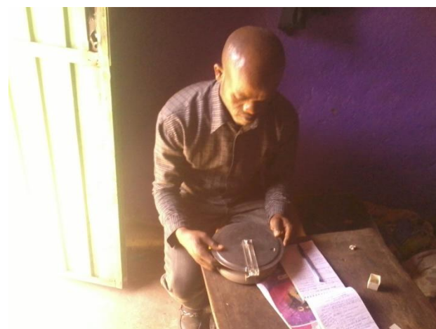
Figure3. Haematocrit reader

Haemoparasites affects the volume of cells by haemolysis which results in anaemia. Therefore, PCV will help to analyze the concentration of blood cells in the animals' body (Murray et al., 1983).