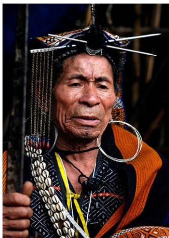
Fig2B. Apatani man