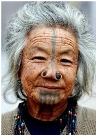
Figure1. Facial Tattoo of Apatani