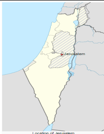
Fig1. Location of Jerusalem of Palestine

Moreover, we analyzed the relationship between the dependent variable as apple production; the independent variables consists of (climate factors) such as mean monthly temperature (T), precipitation (P), soil water reserves (R), and deficit water (Df), and (bioclimate factors ) as annual ombrothermic index (Io), simple continentally index (Ic), and compensated thermicity index (It/Itc), in this study, the Shapiro-Wilk and Jarque-Bera normality tests were applied [27- 30], and the p-value was obtained for the seven variables. We applied analysis of variance (ANOVA) linear regression analysis to each of the eight independent and dependent variables, the three bioclimatic variables and the four remaining physical variables (climate factors), and each of the dependent variable plum yield, in order to obtain corresponding analysis (CA) and the principal component analysis (PCA) were subsequently applied to determine the influence of independent variables on production. These statistical analyses were done using the XLSTAT software.