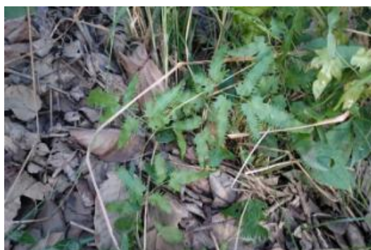
Fig8. Lygodium Flexuosum