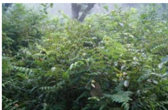
Fig6. Diplazium Esculentum