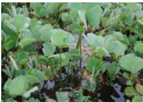
Fig9. Marsilea Minuta

Rhizome long creeping, branched subterranean, about 30 cm. long up to 2 mm thick, green in plants, pale or dark brown in terrestrials, covered by about 5 x 0.25 mm, whitish, soft, slender hairs sparsely or densely all over; roots borne usually on nodes, rarely on internodes; Stipes Scattered, about 1 cm apart, up to 16 x 0.2 cm, usually green rarely pale or dark brown, terete, glabrous or with few hairs as in rhizome. Leaves four, sessile, arranged at the tip of the stipe in clover leaf model, lateral margin entire, outer margin usually entire, veins distinct above and below, peduncle 7 x 1 mm; adnate to the peduncle laterally and perpendicularly, more or less bean shaped, up to 5 x 4 mm, black or dark brown , very hard, densely hairy when young, sparsely or rarely so when mature, slightly, vertically ridged on both convex surfaces; microsporangia and megasporangia enclosed in the same sporocarp and covered by gelatinous layer; microspores yellowish brown , globose, 40 µm in diameter with distinct exine and intine; megaspores ovate, up to 0.65 x 0.5 mm, apex with small pale brown papilla which is surrounded by intine, exine covers all over the surface except papilla, basal region of the megaspores filled with coarse, starch granules and numerous oval –shaped oil globules.