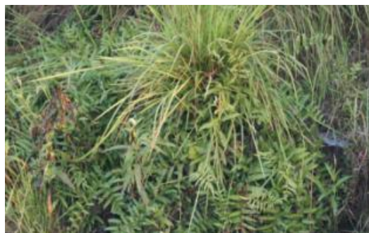
Fig3. Ampelopteris Prolifera

Rhizome wide creeping, up to 1cm thick, scaly; Scales 3 \times 1.5 mm lanceolate, dark brown; Stipes 46 \times 0.3 cm; Lamina 160 \times 30 cm, simple pinnate, elongated with indefinite growth. Pinnae numerous, alternate & sub-opposite, sessile, largest pinna 15 \times 2 cm, lanceolate, apex acute, base truncate, margin crenate; Veins 6-8 pairs anastomosing to form a zig -zag excurrent vein; Rachis adaxially grooved, hairy, texture herbaceous; Sori exindusiate, elongate - oblong, superficial; Sporangia short stalked; Spores bilateral, monolete, ovate, 50 \times 28 \mu m, exine spinulose.