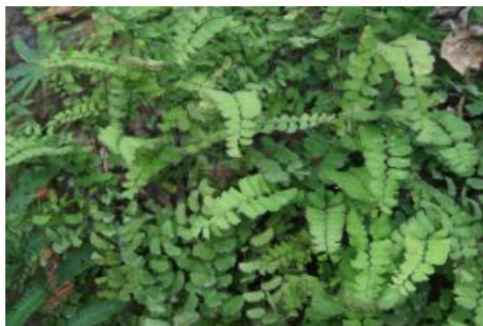
Fig2. Adiantum Lunulatum

Rhizome erect, up to 2 cm thick; scales ovate- lanceolate, apex acuminate, margin entire. Stipes tufted, wiry, numerous up to 14 x 0.3 cm, dark brown and black, scaly at the basal most part, glabrous above. Lamina lanceolate, up to 31 x 6 cm, simply pinnate; pinnae 8 - 20 pairs, alternate, distinctly stalked, pinnae fan shaped, up to 5 x 2.5 cm, dimidiate, upper edge rounded, lobed, margin entire in sterile pinnae; Sori continuous along the edge of the lobe, crescent shaped, spores triangular, 25 x 31 \mu m.