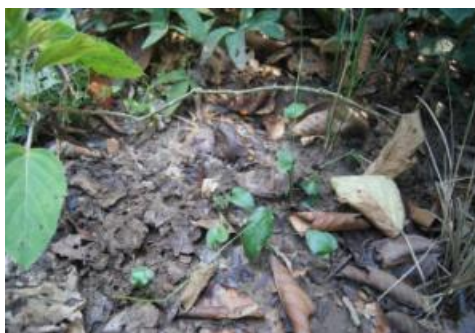
Fig10. Ophioglossum Reticulatum