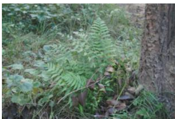
Fig5. Christella Dentata

Rhizome short to long creeping up to 1 cm thick, sparsely scaly; scales lanceolate, 9 \times 1.5 mm, pale brown apex acuminate, margin entire, hairy; stipes up to 2 cm apart, 75 cm long 0.5 cm thick pale brown to dark brown, scaly at the base, glossy and glabrous above. Lamina 90 \times 20 cm, oblong-lanceolate; pinnae up to 20 pairs with up to 10 pairs of reduced basal pinnae, reduced basal pinnae opposite or sub opposite, up to 9 cm apart, unreduced pinnae alternate, 5 cm apart; largest pinna 19 \times 2 cm, apex acuminate, base broadly cuneate, basal one sub sessile, upper one sessile, margin lobed about half way to the costa; lobes up to 35 pairs, 3.5 mm wide; veins up to eight pairs, free, one and half pairs of basal veins anastomosing to form an excurrent vein reaching the base of the 2mm wide sinus; sinus membrane mostly absent; 1 mm long, slender, unicellular, acicular hairs densely distributed all over the rachis and upper surface of costs; upper and lower intervenal area with few minute hairs; sori median on veins up to six pairs, up to 1.25 mm in diameter; indusial with short hairs, spores planoconvex 35 \times 20 \mu\text{m} , brown, exine with elongate, thick ridges.