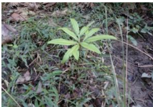
Fig7. Helminthostachys Zeylanica

Rhizome short creeping, up to 1 cm diameter, tuberous, terete with about 3 mm thick fleshy roots arranged in two alternate rows on the abaxial side; adaxial side with single row of closely arranged stipe scars; apex covered by oblong, up to 10 x 7 mm, pale brown entire, rounded scales; stipe solitary, produced annually from the same rhizome, up to 30 x 0.6 cm, pale brown at the base, greenish above, terete, glabrous. Lamina more or less orbicular in outline, up to 30 cm in diameter, ternately divided, each branch shortly stalked; lateral branch bears an accessory leaf at the basal basicopic region, forked equally about 4 cm above from the base the accessory branches of lateral branches pendent, apex acute base cuneate, margin irregularly wavy with sharp edges; veins distinct both above and below, forked once or twice, free, parallel, up to 1 mm apart reaching the margin; lamina pale green, glabrous above and below, texture thin herbaceous. Fertile branch solitary, arising from the sterile lamina with 11 x 0.2 cm stalk, and 7 x 0.9 cm spike; sporangia in small crested clusters forming a loose spike; sporangia in group of four, green group with a small sterile lobe at apex; spores trilete; exine reticulate.