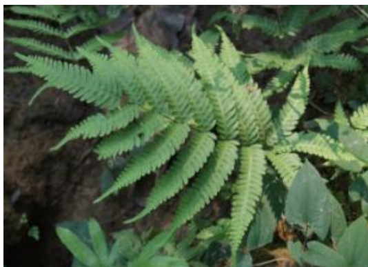
Fig11. Pteris Biaurita

Rhizome erect up to 3 cm diameter, densely covered by scales at the apex scales lanceolate, 3x0.75 mm, pale brown, translucent at the periphery dark brown and opaque at the center, apex acuminate, margin hairy. Stipe tufted, numerous, 36-71 cm long, 3-7 mm thick, pale brown at the base, stramineous above, abaxially rounded, adaxially grooved, scaly at the base, glabrous above. Lamina lanceolate, up to 71x40 cm, bipinnatifid; pinnae up to 12 pairs with one or two accessory branch on the basal basiscopic side of the basal most pairs, subopposite, lanceolate, shortly stalked, apex acuminate, base broadly cuneate, margin lobed within 3 mm from the costa, lobes oblong slightly falcate, up to 3.3 x 0.8 cm, apex rounded, margin entire; veins distinct both above and below, basal veins of adjacent costules forming an along costa with five to seven excurrent veins passing to the sinus base, other veins forked once and reaching the margin; pinnae pale green; texture subcoriaceous; small spinule borne at the base of each costule. Sori borne all along the margin except at the base of the sinus and at the apex of the lobes; spores 47 x 47 µm, dark brown, exine with dense reticulate thickenings and winged perispore.