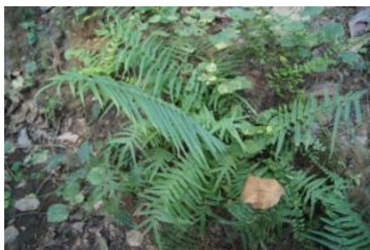
Fig12. Pteris Vittata