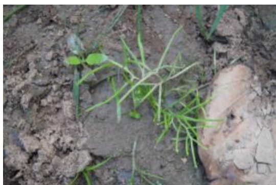
Fig4. Ceratopteris Thalictroides