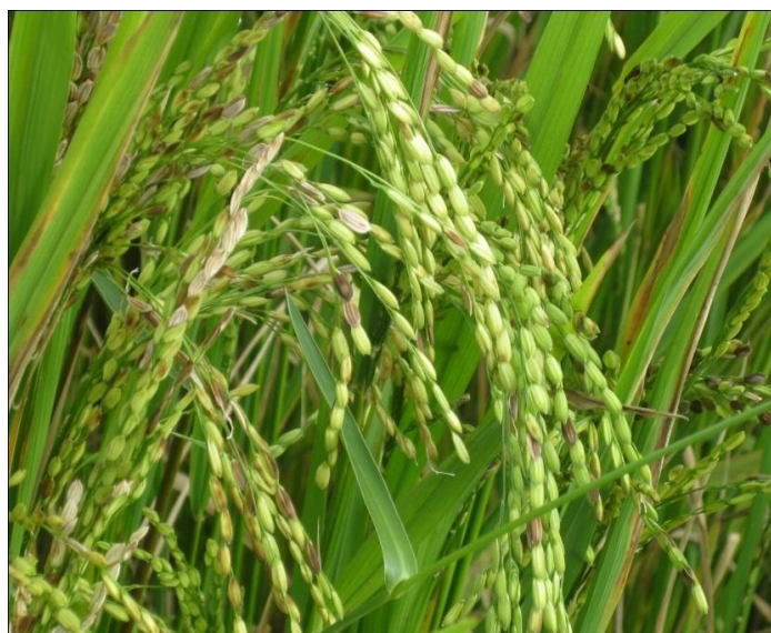
Figure 4. Effects of Thrips infestation on paddy.

Chatterjee also reported a severe outbreak of rice thrips from West Bengal in September 1986, wherein an estimated 60,000 ha was affected [18]. Studies by Dobson et al. and Akemo et al. indicated that the drier the weather, the quicker the onset of thrips damage and the more severe the symptoms [19, 20]. This was also true in our study, as a high thrips populations were observed in during low and infrequent rainfall. The occurrence of A.sudanensis , H.ceylonicus , H.tenuipennis and B.indicus indicate that it may be due to the crop rotation practice in the region. As members of the Anaphothrips species are normally found on plants of the grass family, Poaceae [21], Haplothrips species breed almost exclusively in flowers, with many considered to be host specific [22]. They are particularly associated with the flower of Asteraceae, but considerable numbers are found in the flowers of Poaceae and Juncaceae or Cyperaceae [23, 24] and Bolacothrips species are considered to occur on grasses and on economic crops such as corn, rice, sugarcane and wheat [15]. There has been conspicuously little progress made in the chemical basis of thrips/host plant interactions since Kirk's review in 1995 [25]. A diversity of studies documented the variability in thrips performance and host selection based on plant genotype [26, 27, 28], plant parts and age [29, 30], or the influence of cultural conditions on thrips preference and performance [31, 32].