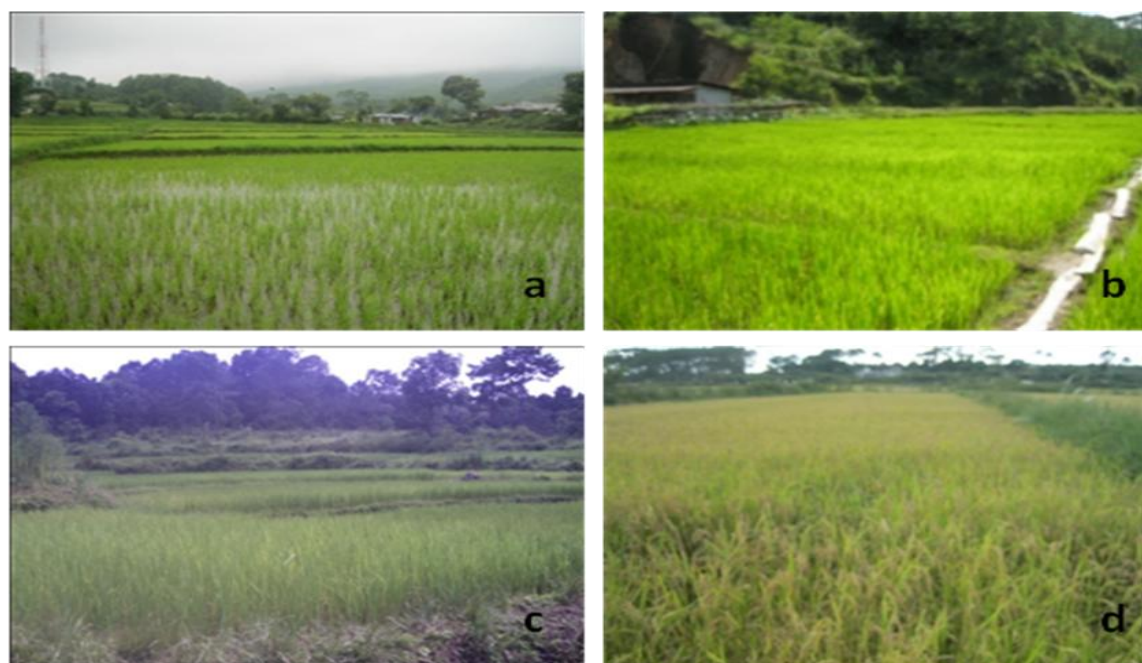
Figure 2. Study site at a, Mawlai. b, Myllem. c, Nongjri. d, Nongbah.