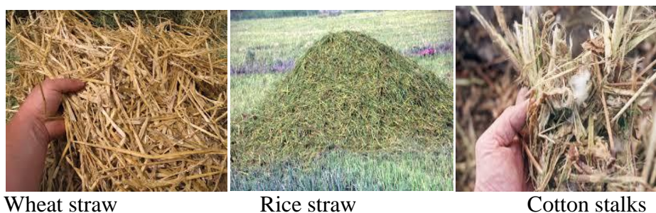
Fig 1. Different agricultural residues

Agricultural residues are basically biomass materials that are by product of agriculture. It includes cotton stalks, wheat and rice straw, coconut shells, maize and jowar cobs, jute sticks, rice husks, pigeon pea stalks etc. Many developing countries have a wide variety of agricultural residues in ample quantities. Agricultural residues which are considered waste can be converted into high energy through biomass gasification. Other benefits of biomass gasification include: reduced need for landfill space for disposal of solid wastes, decreased methane emissions from landfills, & reduced risk of groundwater contamination from landfills. Theoretically, almost all kinds of biomass with moisture content of 5-30 % can be gasified; however, not every biomass fuel leads to the successful gasification. Coconut shells and maize cobs have been successfully tested for fixed bed gasifiers and they unlikely creates any problems. Most cereal straws contain ash content above 10 % and present slagging problem in downdraft gasifier. Rice husk with ash contents above 20 % is difficult to gasify.