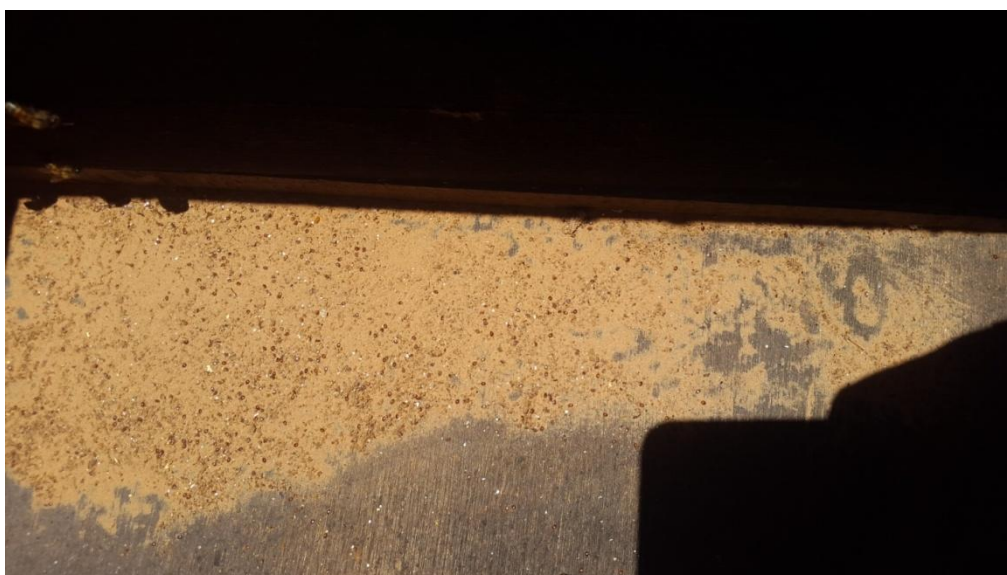
Fig2. Varroamite on sand on bee hive bottom board.