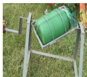
Improved plastic milk churner