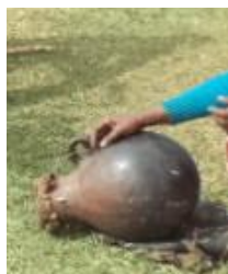
Traditional clay pot churner

Direction on methods of installation and operation of the newly designed plastic milk churner was given to the experimenting farmers.