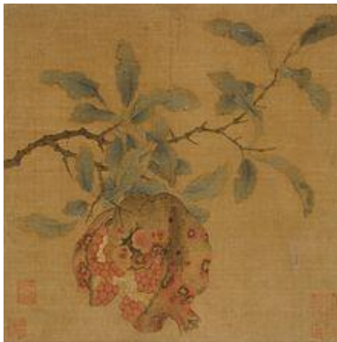
Fig4. Pomegranate, late Southern Song dynasty or early Yuan dynasty circa 1200–1340 (Los Angeles County Museum of Art)

It is also extensively grown in South China and in Southeast Asia, whether originally spread along the route of the Silk Road or brought by sea traders. Kandahar is famous in Afghanistan for its high-quality pomegranates. Although not native to Korea or Japan, the pomegranate is widely grown there and many cultivars have been developed. It is widely used for bonsai because of its flowers and for the unusual twisted bark the older specimens can attain the term "balaustine" (Latin: balaustinus ) is also used for a pomegranate-red color.