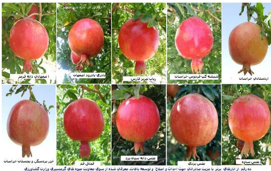
Fig8. Different Pomegranate in Iran

Pomegranate ( Punicagranatum L. ) is a deciduous shrub and native to Iran having ancient culture in this country and Iran is one of the biggest producers of pomegranate in the world. This fruit is used in traditional medicine because of its antibacterial, anti-inflammatory, and alleviative characteristics. Extracts of different parts of pomegranate fruit is rich in phenolic compounds and its rind extract and seed oil have vigorous antioxidant activity. Elagic acid is one of the most important phenolic compounds with antioxidant activity, present in the pomegranate rind extract. Inhibitory effect of pomegranate seed oil on breast and skin cancer has been reported. Use of seed oil and extracts of different parts of pomegranate fruit has been considered in production of phytoestrogenic compounds. At the present time, the fruit of pomegranate besides its use as a fruit and having nutritional value is also considered for its pharmaceutical characteristics. This paper is a review on articles and different sources in order to get more familiarity with medicinal characteristics of this fruit.