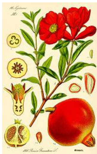
Fig3. Illustration by Otto Wilhelm Thomé, 1885