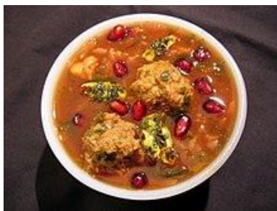
Fig7. A bowl of ash-e anar , a Persian soup made with pomegranate juice

After the pomegranate is opened by scoring it with a knife and breaking it open, the seeds are separated from the peel and internal white pulp membranes. Separating the seeds is easier in a bowl of water because the seeds sink and the inedible pulp floats. Freezing the entire fruit also makes it easier to separate. Another effective way of quickly harvesting the seeds is to cut the pomegranate in half, score each half of the exterior rind four to six times, hold the pomegranate half over a bowl, and smack the rind with a large spoon. The seeds should eject from the pomegranate directly into the bowl, leaving only a dozen or more deeply embedded seeds to remove. The entire seed is consumed raw, though the watery, tasty sarcotesta is the desired part. The taste differs depending on the variety or cultivar of pomegranate and its ripeness. [Citation needed]