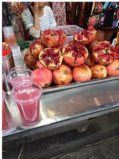
Fig6. A stall selling pomegranate juice in Xi'an, China