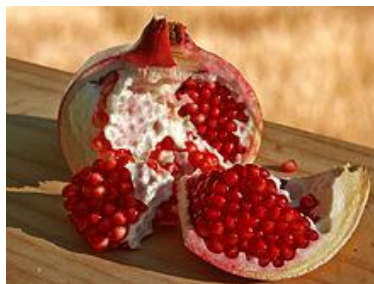
Fig2. An opened pomegranate

The name pomegranate derives from Medieval Latin pōmum "apple" and grānātum "seeded". [5] Possibly stemming from the old French word for the fruit, pomme-grenade , the pomegranate was known in early English as "apple of Grenada"—a term which today survives only in heraldic blazons. This is a folk etymology, confusing the Latin granatus with the name of the Spanish city of Granada, which derives from Arabic. [6]