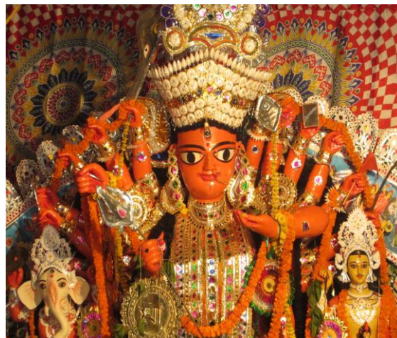
Fig-5 and 6 the Astadasabhuja Durga of Baliarpur, Paschim Mednipur