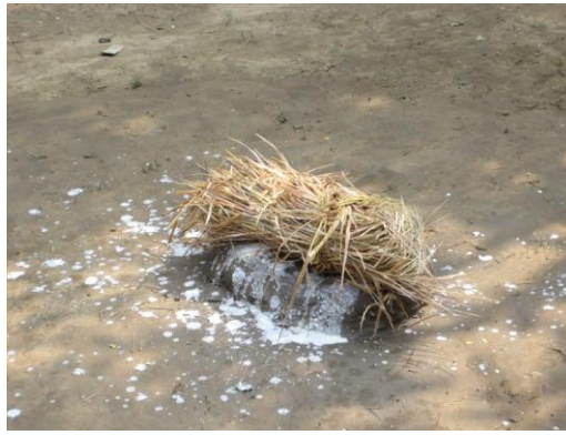
Fig9. And the sacrificial temporary alter built every year since 1978 to sacrifice- fruits and vegetables in odd numbers of 1, 3 or 5.