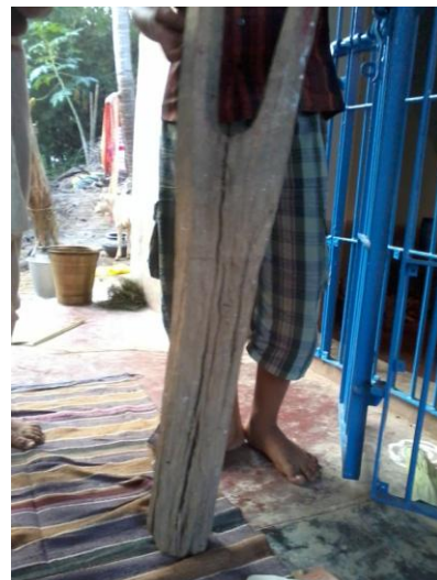
Fig.7 and 8 The yupakastha used for goat sacrifices. On the left is the one that is still in use at Radhakrisnapur and on right is the old one from Baliarpur which has not been used since 1978 flood.