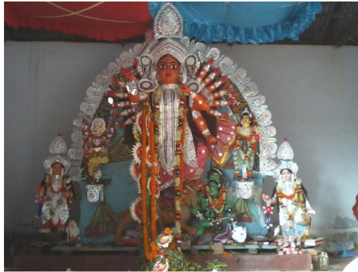
Fig4. The Astadasabhuja Durga of Radhakrisnapur, Paschim Mednipur