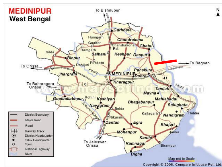
Fig2. The location of Ghatal subdivision- marked in red