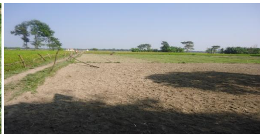
Plate2. Chilli cultivation on floodplain (char)