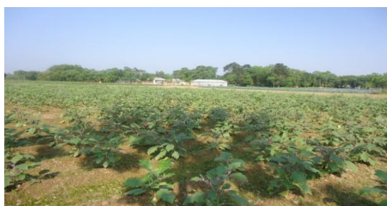
Plate3. Brinjal cultivation on floodplain