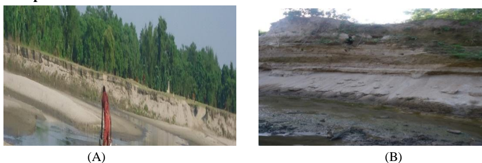
Plate6 (A) & (B). River bank composition at the western part of the floodplain (char).