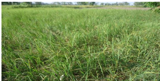
Plate1. Paddy practices on floodplain (char)

In addition with increasing population, the agricultural landuse practices change with time. Clearing of riparian vegetation cover for agricultural use and changing of agricultural practices, soils of river bank become weak and eroded easily. In field observation, erosion process is two times more in the upper part of the study area than the lower part.