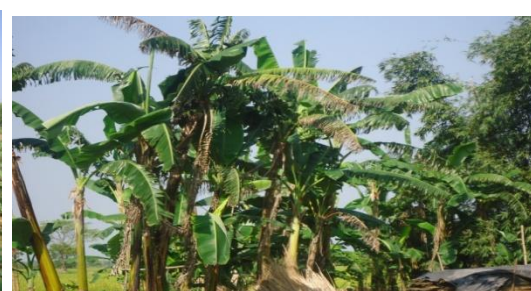
Plate4. Banana trees at Tikiner char (char)