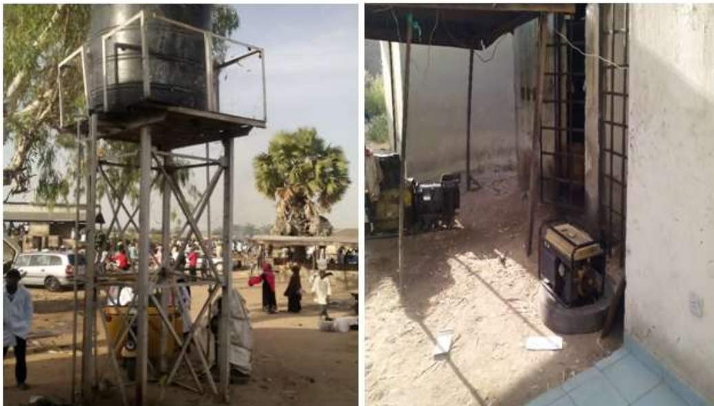
Plate 5. Overhead tank at abattoir and small generators for pumping water

To meet the increasing demand and number of animals slaughtered daily in the abattoir, the butchers union constructed additional slaughter slabs just beside the main slab within the premises. To improve the management of the Jalingo abattoir waste, water well was dug within the premises. This was further complemented with the drilling of borehole, overhead tank and ground water reservoir (Plate 5 and 6). This allows for adequate water supplies to flush the abattoir waste daily and cleanup the slaughter slabs. Information gathered from the respondents interviewed reveals that when there is shortage of water supplies, it affects the cleanup of the abattoir resulting in stench from the improperly flushed animal blood and faecal matters. The effluents (blood and liquid intestinal contents) are flushed into a drain that empties into a shallow depression within the abattoir premises. This shallow depression has been over grown by plants. The sight is an eyesore and a breeding ground for rodents and parasitic insect pest.