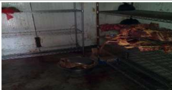
Plate 7. Meat in the Abattoir Coldroom

The quality of management of abattoirs and slaughter slabs, particularly, the adherence to standard practice of meat inspection and sanitation is a key to sound public health standard (Nwanta et al, 2008). An efficient abattoir operation and meat hygiene programme is a service for healthy living of the public. The union of the butchers procured a cold room (Plate 7) within the premises through partnership with people of goodwill.