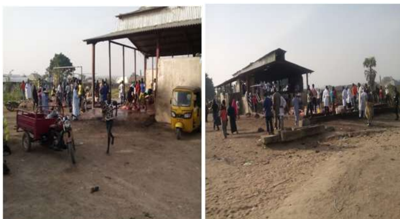
Plate. 1. Jalingo abattoir slaughter slab

Abattoir waste can be defined as waste or waste water from an abattoir which could consist of the pollutants: condemned organs, carcasses, animal faeces, blood, fat, hides, carcass trimmings, paunch content and urine. The findings of the study shows that there were serious challenges with the management of the Jalingo abattoir from its inception under Jalingo Local Government Authority to its present condition under a state capital. The government has not paid attention nor fund the facility. This situation has been reported by Nwanta et al, (2008) which observed that the establishment and management of abattoirs and wastes in Nigeria have always been regarded as social services by all the three tiers of government. Each of these government authorities has for many years neglected its function and has been apathetic about taking over responsibilities (Nwanta et al, 2008). The findings of the study show that the Jalingo main abattoir was constructed in 1979 by Late Abubakar Barde, the then Governor of the defunct Gongola state. It was commissioned for use in 1980. The abattoir was constructed when the town was a Local Government head quarter. Despite the growth of the town to the status of state capital, the abattoir has not expanded to accommodate the increasing pressure and demand for meat and meat resources.