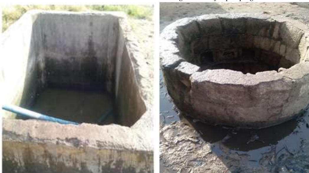
Plate 6. Water reservoir pump from borehole and Ground well in the abattoir.