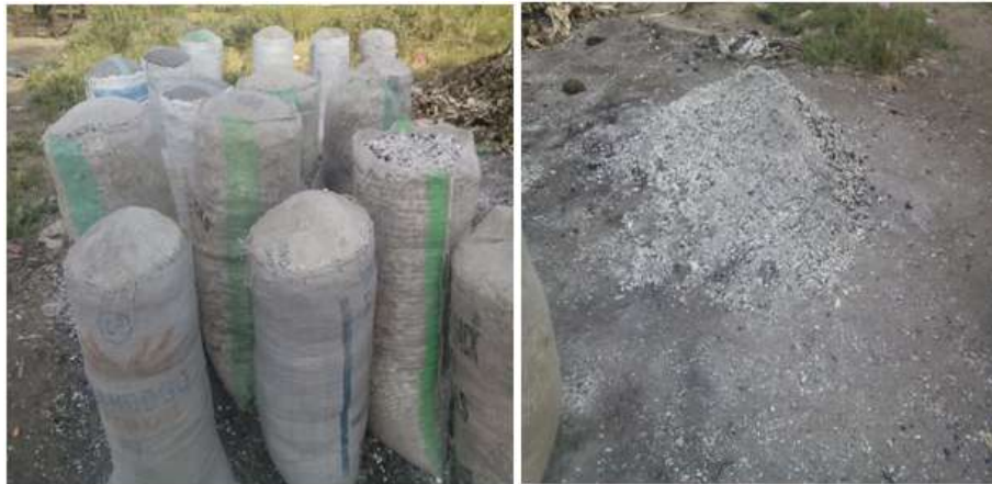
Plate 2. Bone waste burnt, crushed and bagged for shipment to feed mill