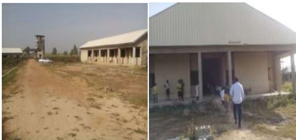
Plate 8. New Modern Jalingo Abattoir Under Construction and Abandoned

The quality of management of abattoirs and slaughter slabs, particularly, the adherence to standard practice of meat inspection and sanitation is a key to sound public health standard (Nwanta et al, 2008). An efficient abattoir operation and meat hygiene programme is a service for healthy living of the public. The union of the butchers procured a cold room (Plate 7) within the premises through partnership with people of goodwill.