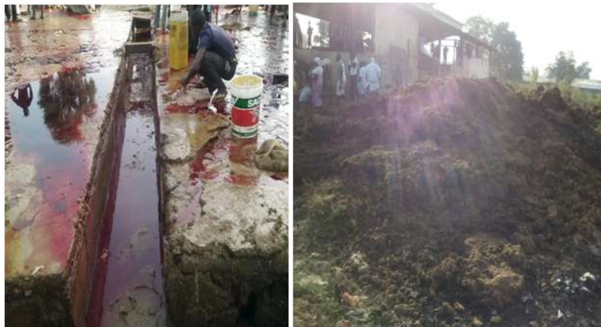
Plate 4. Abattoir sewage drain and heap of paunch content