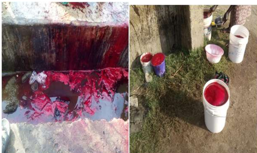
Plate 3. Blood waste from animal slaughter and collected animal blood for blood meal