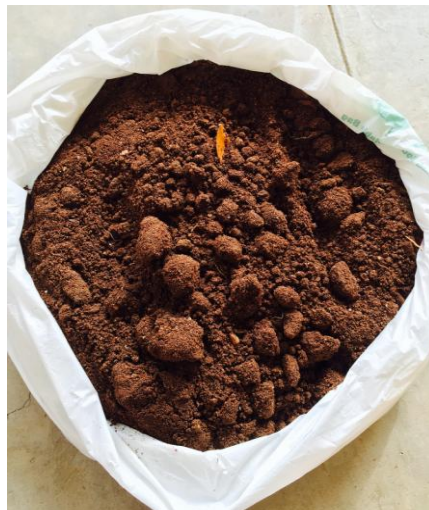
Fig 3.2 SOIL (pH 7.4)