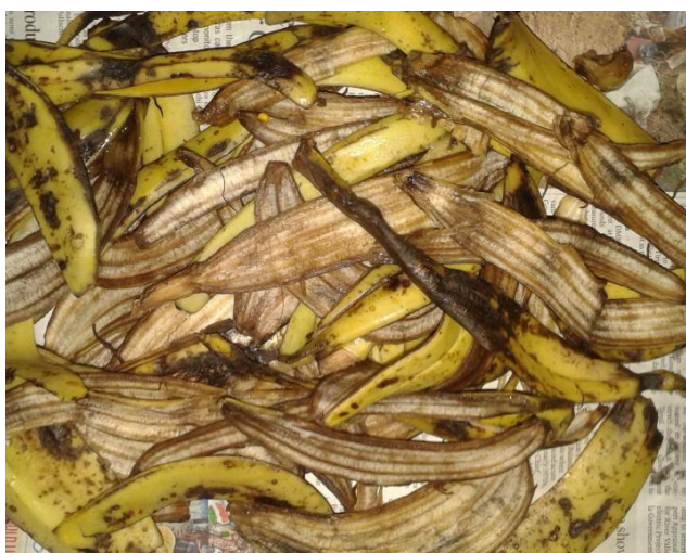
Fig 3.1 Fruit Waste