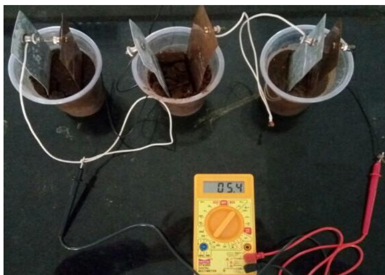
Fig 4.2. Three vermicompost cells in series produce 5.4V