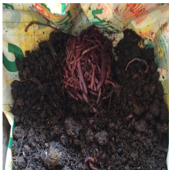
Fig 3.4 Earthworm species ( Eudrilus eugeniae )