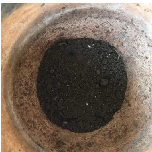
Fig 3.3 Pre composting of fruit waste without earthworms (20 days)