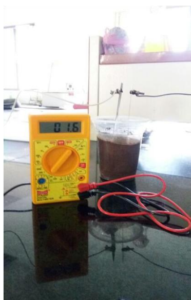
Fig 4.1. Single vermicompost cell produces 1.6V