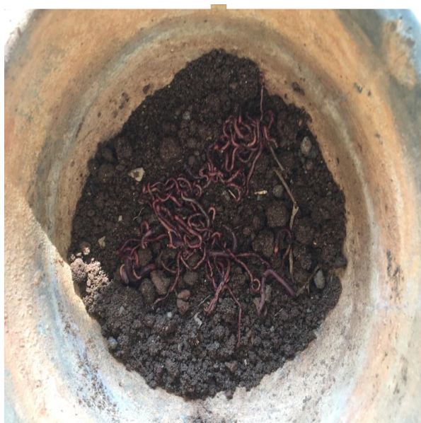
Fig 3.5 Earthworms introduced into the sample pot for vermicomposting (30 days)