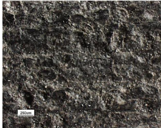
Figure1. Proppant embedment on fracture surface

conductivity. And 20% reduction in fracture aperture can lead to more than 50% reduction in recovery factor [31].