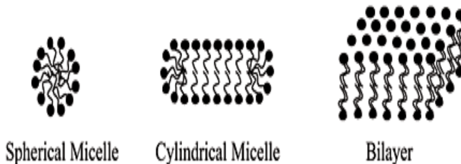
Fig3. Schematic illustration of the three most commonly observed geometrical shapes of surfactant micelles [11]

The micelle shape formed by non-ionic and ionic surfactants is scientifically quite controversial [10].