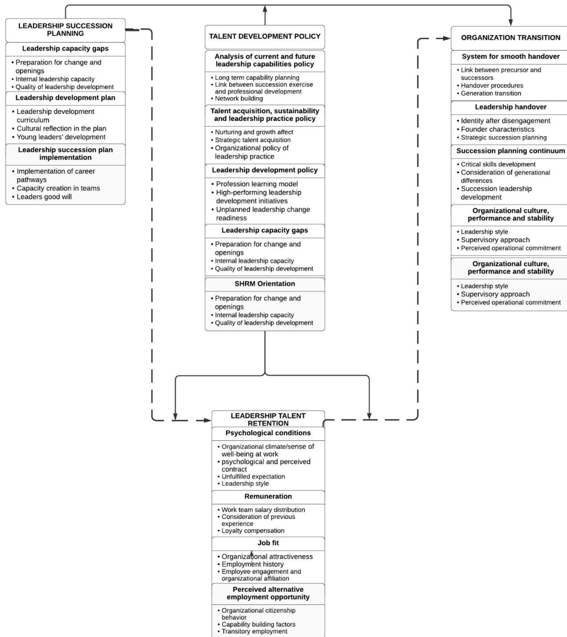
Figure2. Leadership Succession Planning, Leadership Talent Retention, Talent Development Policy, and Organization Transition.

Proposition 5: The mediated effect of leadership talent retention on the relationship between leadership succession planning and organization transition will be moderated by the dictates of the talent development policy.