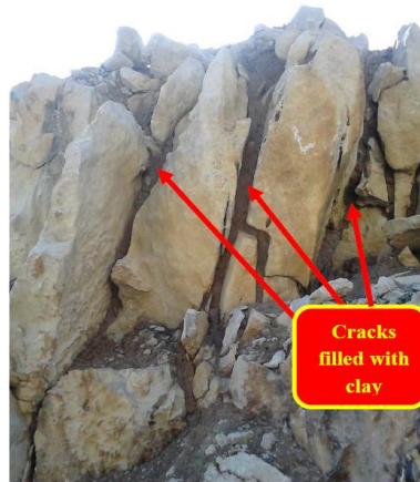
Fig3. Vertical fractures filled with clayey material

especially in the top bench. National Geophysical Research Institute (NGRI), Hyderabad conducted mapping of underground voids/cavities by Ground Penetrating Radar Surveys upto a depth of 15 m (Anon., 2013). The outcome of the study revealed that the rock of the study area was highly weathered having vertical fractures and at most of the places filled with clayey material (Fig. 3).