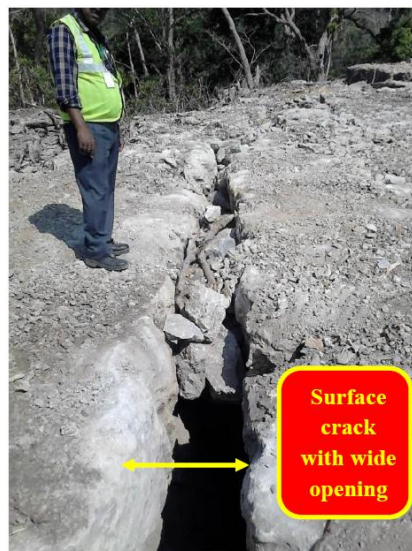
Fig4. Developed cracks at the surface

Crevices with an opening of 0.40 to 0.50 were also observed at the surface as shown in Fig. 4. At places, in the lower bench fractures were closely spaced (Fig. 5).