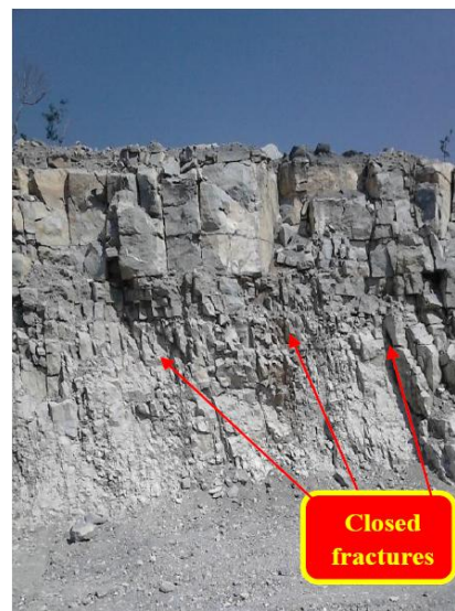
Fig5. Closed fractures at bottom bench