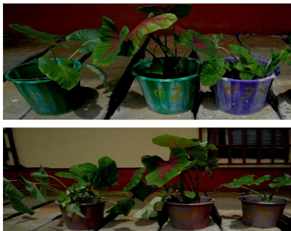
Plate1. Picture of Caladium bicolor and C. tricolor