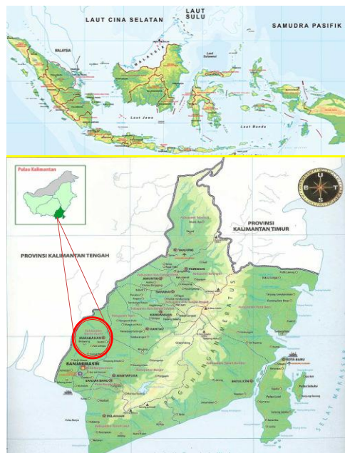
Figure2. The map showing the investigated area in Barito Kuala District, South Kalimantan Province