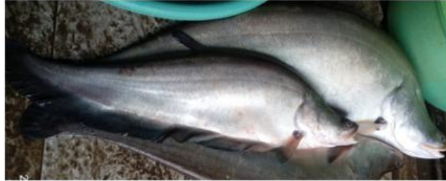
Figure1. Sample of the giant featherback from Barito Kuala District

[7], the featherback with medium size reach maximum of 100 cm length with average weight of 0.5-1 kg, while in nature it can reach up to 2-4 kg of fish. Its body shape is flat with small head size and at the nape of its neck looks hunchback. Maxillary located far behind the eyes, and the body is covered with small scales. Scales on the back is gray while in the belly is silvery white. The sides are white circles as black balls, each surrounded by a white circle. With increasing age, body decoration flat fish will disappear and be replaced by lines of black.