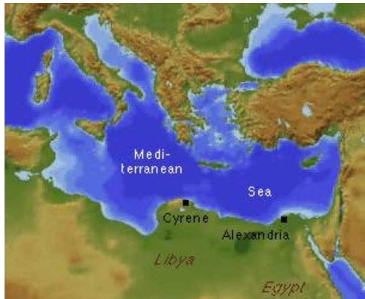
Fig3. The antique city of Cyrenæ.

Cyrenæ used to be in Ancient Lybia; now its site is in Egypt, on the shores of the Mediterranean Sea, no far from Alexandria; see map 3.