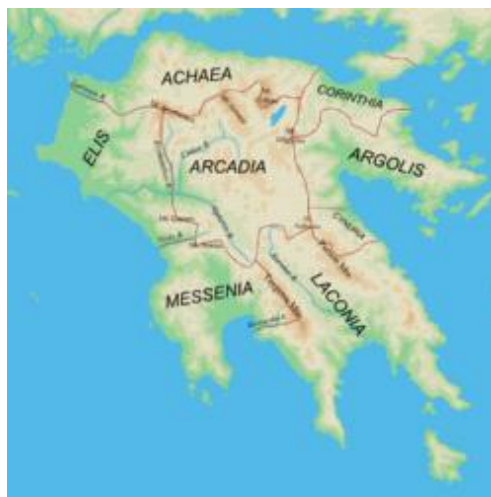
Fig2. Arcadia; Source: Ancient Regions Of Peloponnese - Peloponnesus Ancient Greece Map - Free Transparent PNG Download - PNGkey

Arcadia is in central Peloponnese; see map below, fig. 2.