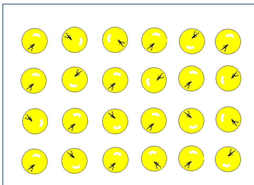
Fig2. Impression of 24/7 lockdown regulations and psychological development in young adults

However, the lockdown regulations, school and university closings, bans on public gatherings, etcetera, have an unprecedented impact on psychological development of the young generations (Fig. 2), as well as on the socio-economic development of society as a whole. It reminds us of the following quote: "a society that criminates its youth is doomed to follow a sure path to self-destruction". However, before to proceed with hyperbolic schemes of the proverbial clash of the generations – like these associated with previous eras, when young men were called up for war and where so many lives were lost - , I think it is necessary to re-evaluate the philosophical framework that describes how governments act as a regulator of demographic developments (see paragraph 5. Biopolitics and the choice of talk show programmers...).