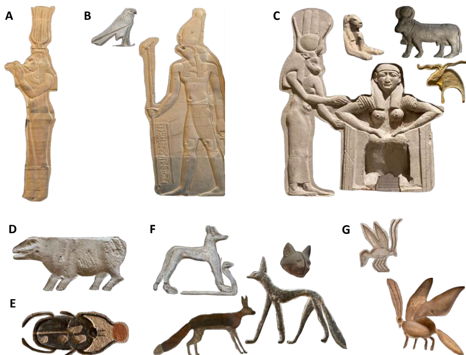
Figure 1. Animal representations in ancient Egypt culture with connection with human health. (A) Lion: Sekhmet, the goddess of healing and medicine. (B) Falcon: Horus, the god of protection. (C) Cow: Goddesses of birth, fertility, and nourishment. (D) Hippopotamus: Opet and Taweret, goddess of protection and nourishing. (E) Scarab S. sacer : symbol of the sun god Ra with protective capacity. (F) Dogs and cats: prominent roles in Egyptian mythology and human protection. (G) Bees: association with prevention of infectious diseases. Images and design by the author.

Bees: association with prevention of infectious diseases. Bees were associated with Egyptian royalty and pharaoh titles [Fig. 1G]. Beekeeping was practiced in ancient Egypt with moving hives all over the Nile to pollinate flowers in season. Honey was used for preventing infection by being placed on wounds.