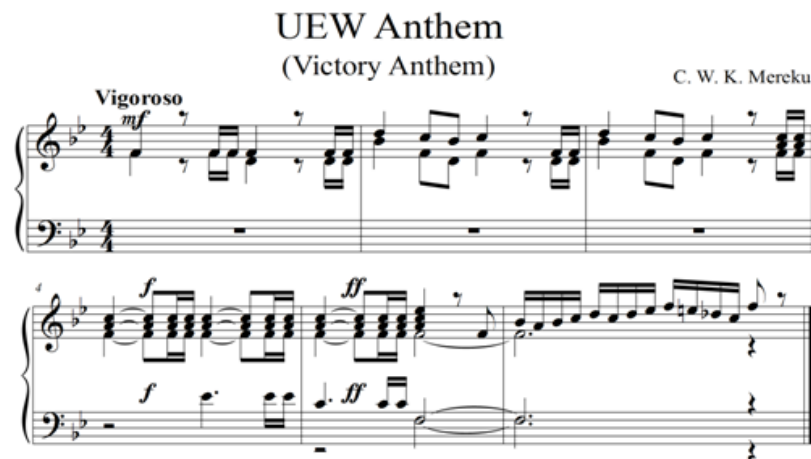
Figure1. Introductory passage to UEW Anthem

Varied rehearsal techniques were used subsequently during the implementation process. The second day of meeting the band offered an opportunity for the researcher and the bandsmen to confirm the transcriptions done for the anthems by way of playing or practicing them as transcribed. The first anthem tackled, among the three, was the Victory anthem. This anthem is of the quasi-polyphonic texture and therefore required more time to accomplish its study. Ample time was given to the introductory fanfare passage and the various rehearsal sections as indicated by rehearsal letters by the composer in the score. The introduction is illustrated in piano reduction score below: