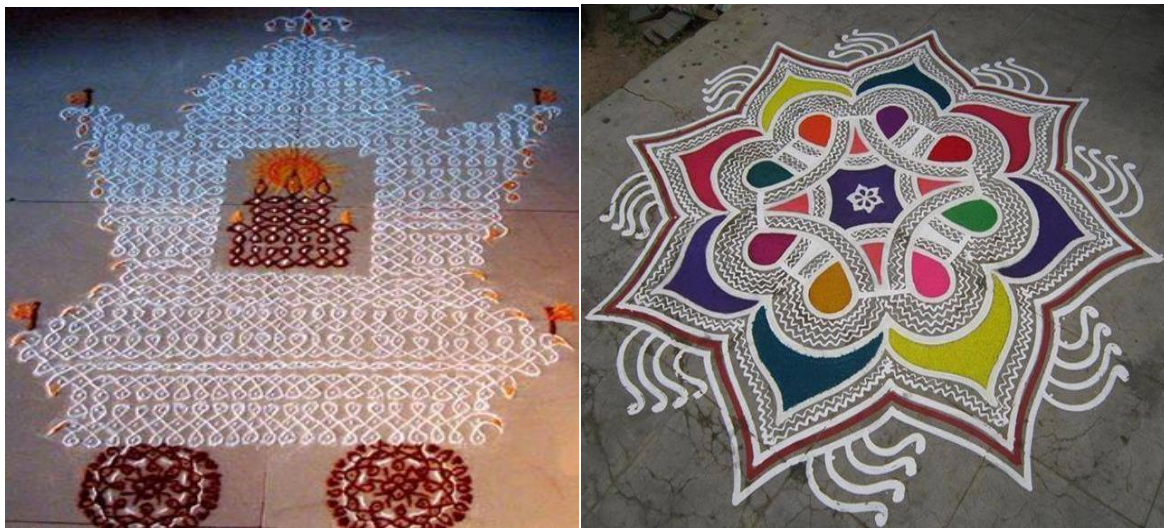
Fig5. Shows the patterns of Kolams

To watch the colorful procession the Mylapore residents in the four Mada streets open their homes to strangers and people climb on the terraces or even take best vantage positions in the first floor. Even the author had a great festival experience this year. During this festival to attract the gaze of the deities Kolams are drawn on the streets approaching the temple. Kolam is an exquisite south Indian art form. It is very crucial that these Kolams are created before sunrise every day especially during the time between four and five in the morning which is called Brahma-muhurtam (the time of God's face when the deities turn their faces towards humans). According to Ayurveda it is an ideal time for meditation and Yoga as one can enter effortlessly into a state of higher consciousness. The Kolam festival is very popular in Mylapore and the intricate design which is drawn with many dots is much more than just an aesthetic art. It is an ornamental floor graffiti painted by Hindu Women of Tamil Nadu which adorns the doorways of the houses, yards, temples, public ceremonial places and the sanctuaries (Fig.5). These kolams are made of a single line and the complex ones with several superimposed figures. The womenfolk who make these kolams are not trained artist and very often not literate but they have extraordinary talents to store these huge repertoire designs and patterns in their memory and retrieve them with ease while drawing.