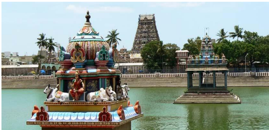
Fig3. Kapaleeshwarar Temple

In Kapaleeshwarar temple (Fig.3) Mylapore, Lord Shiva ( alias Kapaleeshwarar) along with Parvati is taken in a procession around the four Mada Veedhi's (four streets around the temple) each day at night.