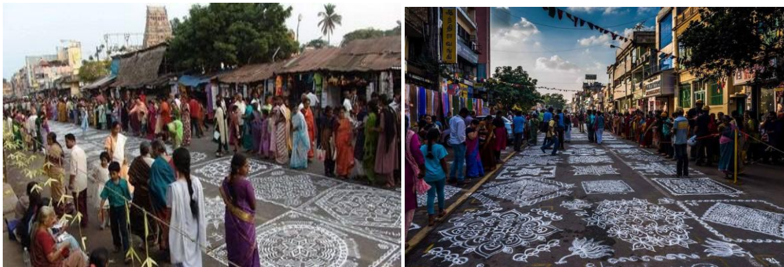
Fig7. shows the kolam competitions held by Sundaram foundation organization to safeguard and protect Mylapore' intangible cultural activities of different kind (Source Mylapore times, 2015)

Being a resident I always consider Mylapore community as a healthy one because of its ability to preserve and retain its identity and uniqueness of its local culture. Through the history of foreign occupation and into the present times culture has offered an abiding source of identity and stability for the people in Mylapore which is our cultural capital. Following are the reasons to justify why and how these traditional Kolam festivals (refer Fig.7) act as a social mechanism and play a significant and far reaching role in our communities.