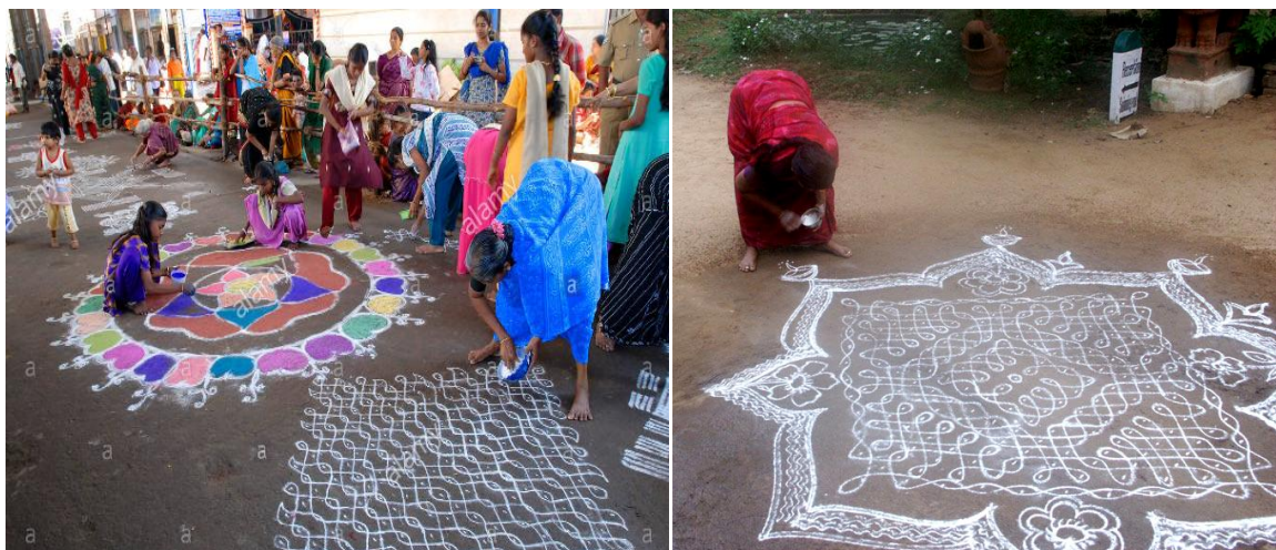
Fig6. shows the art of making kolams

For example the art of Kolam at the most instrumental level is just a decorative form. But at the latent level it is the activity which improves our creative ability and a very good stress relieving activity.