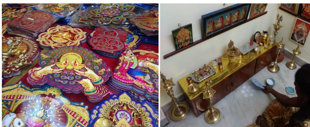
Fig8. Kolam art is getting commercialized in the form of stickers and Kolam instruments

In these modern times of glitter and flashiness, this classical art form of Kolam, despite its richness in culture and tradition, has been performing under par and started losing its distinct identity especially in the urban areas due to shrinking public spaces and fast paced lifestyle. Today Indian women are so deft and self sufficient that they have taken up their careers in corporate sectors and their demands of work and home pose great challenges in practicing this art form in their day to day life. As a consequence Kolam which was once drawn with dry rice flour daily is replaced through modern interpretations like acrylic paints and vinyl stickers for permanency (fig.8). And also there is a marked reduction in the number of women who practice this kolam art on a regular basis and there is no formal transmission to the younger generation.