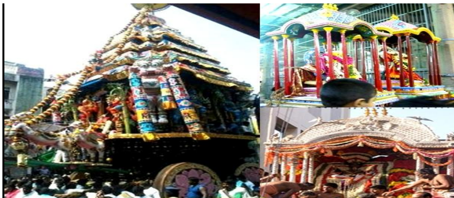
Fig4. shows the Ther (Temple car) on the left and Lord Shiva (Right down) with Nayanmars (Top Right)

Sriram a historian says “No other temple has this big a procession of the 63 Nayanmars (saints) during the eighth day of the Panguni festival Arupattumoozar Vizha (feast of the sixty-three saints) (Refer Fig.4) The unique aspect of the procession is that as the palanquin of Lord Kapaleeswarar (Shiva) moves forward, those of the 63 Nayanmars circumambulate Kapaliswara, moving backwards, facing Lord Shiva with folded hands.