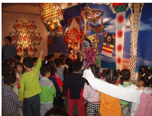
Visitation in Kite Museum