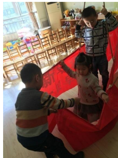
Making Land Boats