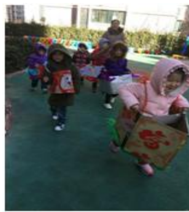
Running Land Boats