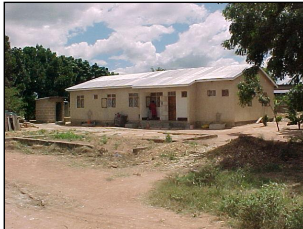
Fig1. A house constructed through cooperative efforts in Dodoma, Tanzania.

that was provided either free or at subsidized price contributed towards reducing construction costs. The fourth aspect is financing. Housing Cooperatives that were established in 1970s and 1980s managed to access financial loans from the then Tanzania Housing Bank (THB) for their members. This component was crucial in house construction apart from the fact that in some instances, the amount of loans was not adequate for cooperative members to complete their house construction.