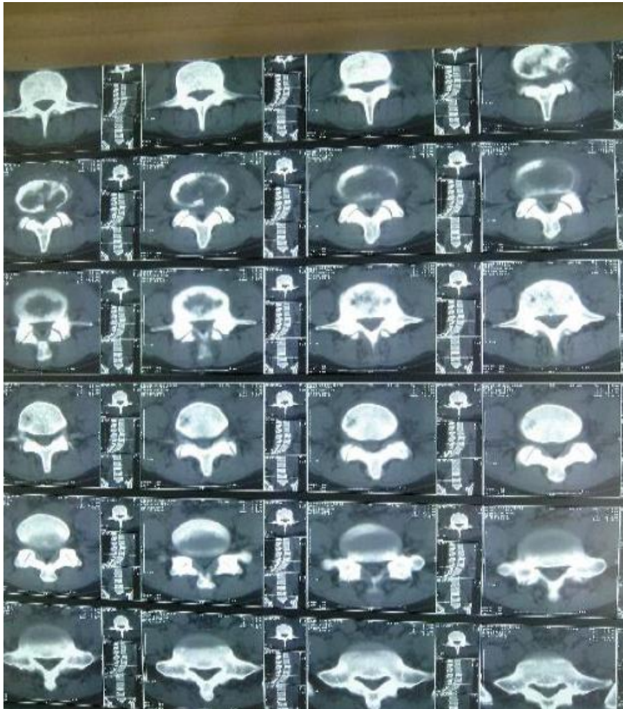
Computer tomography report of potts disease at TTH (Chest Clinic Register)

The disorder was common among women and young adults (76.7%). Chronic back pain and neuropathy were the frequent presenting complains (53.3%). The dorsal spine remains the site of preference while L1/L2 recorded the highest incidence (73.3%). The vertebral body was destroyed in all the cases and the fragmentary type of bone destruction was the common observation. The incidence of cord compression demonstrated by CT was high (73.3%). Other findings were Para spinal and epidural masses observed in (66.7%) and (73.3%) respectively.