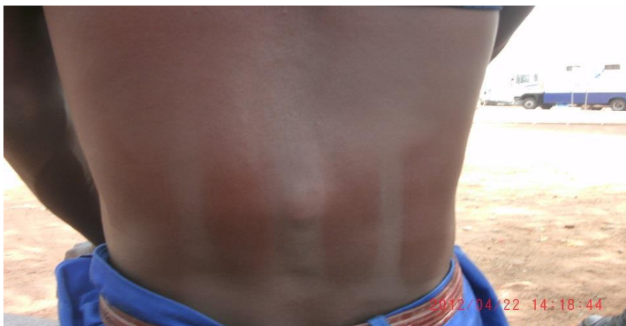
Ilosoaabscess /L1/L2 degeneration (from Tamale Teaching Hospital Chest Clinic)