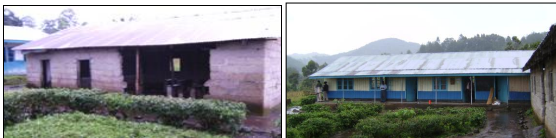
Fig2. Mbafwa primary school buildings: On the top stands a damaged school building after the earthquake episode in 2000/01. At the bottom stand wooden classrooms reconstructed after the quake episode.