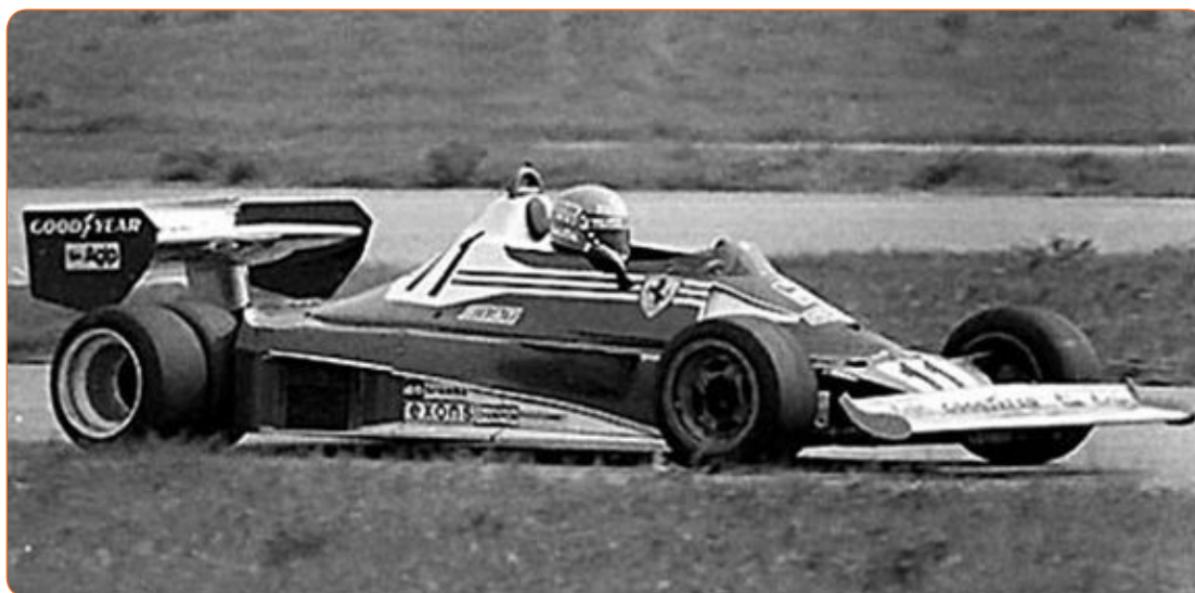
Figure 2.4.2-1. Ferrari 312T6

Ferrari were also optimistic about the six designs in 1976. Ferrari agreed with the idea of Tyrrell that the front wheels be reduced. The third couple of wheels were placed side by side on the rear wheel, as shown in (2.4.2-1). But because of the accident occurred in the test, this plan was shelved.