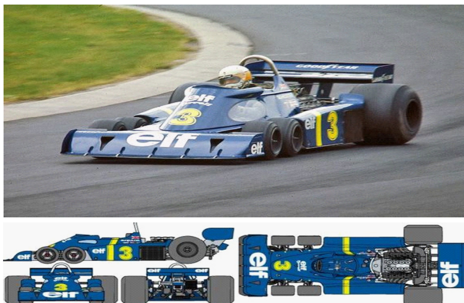
Figure 2.4.1-1. Tyrrell P34

Two pairs of front wheels of Tyrrell P34 both undertook steering function, but because of this design, the drivers needed to abandon their former driving habits. Also, the judgment for choosing the best route will get some interference. Furthermore, complex structures also brought excessive weight. Smaller diameter caused a more severe wear. Therefore, this design did not reappear after Tyrrell P34.