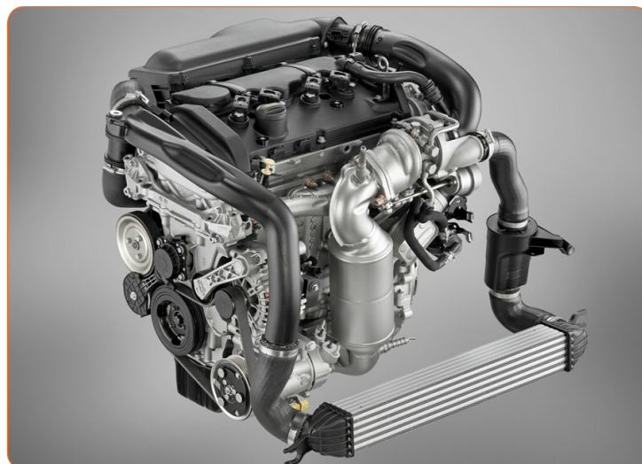
Figure 3.1-1. Turbine engine

In 1977 Renault tried to apply 1.5 liter turbo engine on its racing, and obtained good results, which caused internal differences of F1 official then. Because turbine engines are complex machines, the cost of its development will be fairly high. So only some of the major manufacturers such as Renault, Ferrari and Alfa Romeo might be interested in it. In contrast, the other small team was more dependent on the old DFV engine. As a result, the event was bound to greatly lose its ornamental.