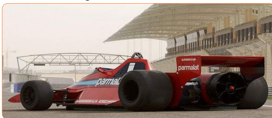
Figure 2.2.2-1. Brabham BT46B

In the Swedish Grand Prix in 1978, Brabham BT46B's debut earned a huge success, which led to complaints from the other teams. In addition, the drivers also complained that the fan will blow stones and other debris to them during the race. Then the official banned it permanently as movable aerodynamic devices.