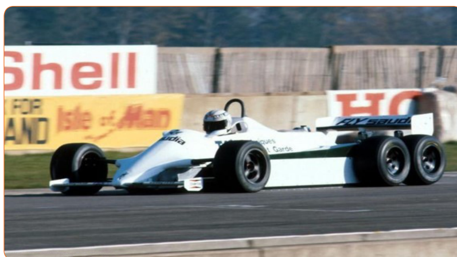
Figure 2.4.3-1. Williams FW08B

At this stage, almost all of the innovations and bans were related to the aerodynamics. Introduction of aerodynamics made this sport become a combination of many fields, but also increased risks. Aerodynamics attached great impact on the racing. The most significant point is that the shape of the car was transformed from the bullet to the streamline. However, streamlined appearance led to not only lower resistance but also decreased grip. Thus there came a lot of solutions mentioned