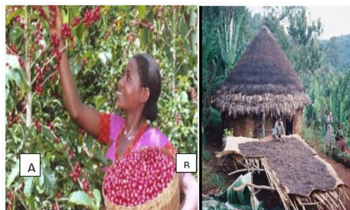
Figure3. Ripe coffee berry collection (A), Coffee berry dry processing method at household (B)

Shade tree regulation and pruning can reduce the populations of the borer by creating unfavorable environmental conditions, and also exposing them to attack by the natural enemies of the borer (Crowe and Tadesse, 1984). Coffee berries should be collected as soon as they ripen (picking should be carried out at least every two weeks during fruiting peaks and every month at other times).