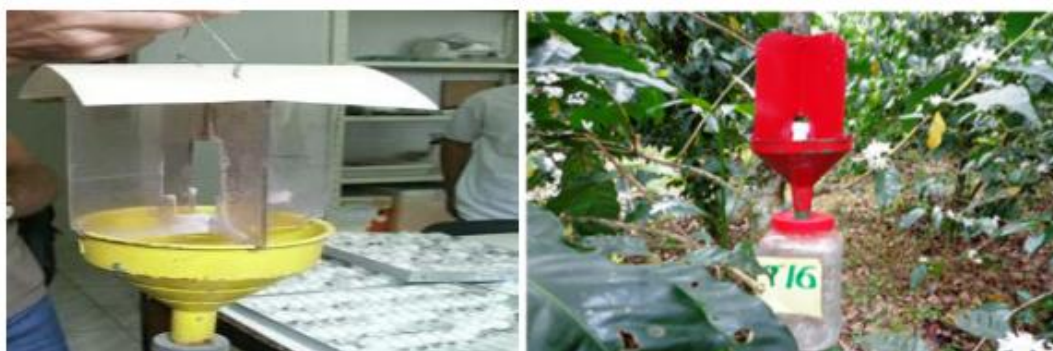
Figure4. Coffee berry borer traps developed by FAO

This technique consists of diffusing attractants in coffee trees to attract pests into a trap. The attractants may be pheromones, or simple chemical substances (FAO, 2005).