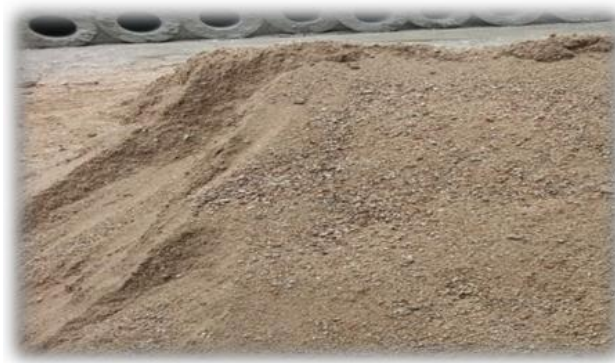
Figure3. Fine Aggregate

Fine aggregate is a naturally occurring granular material composed of finely divided rock and mineral particles. Those fractions from 4.75 mm to 150 microns are termed as fine aggregate. Figure 3 shows fine aggregate.