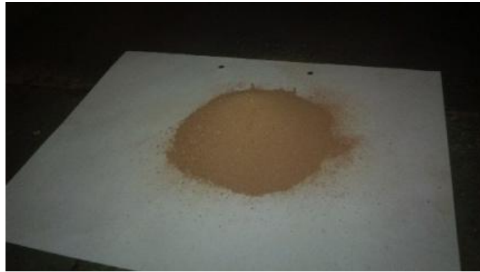
Figure1. Textile ETP Sludge

had 9.66% moisture content. The sludge was sundried at average temperature of 32°C for 66hrs. Figure 1 shows the Textile ETP sludge. Table 1 shows the chemical composition of Textile ETP sludge.