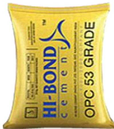
Figure2. Hi-bond 53 Grade OPC

The cement utilized for the present examination was Ordinary Portland Cement (OPC) Grade -53 (Hi-bond 53). It is conformed to the requirement of Indian Standard specification IS 456: 2000. Figure 2 shows Hi-bond 53 Grade Ordinary Portland Cement. The physical and chemical composition is given in Table 2 and Table 3 below.