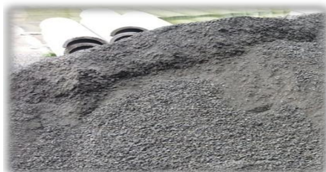
Figure4. Coarse Aggregate (Semi Grit)

Coarse Aggregate (Semi Grit) is the heavier sand than typical sand and is very versatile sand used for many different tasks and jobs. Semi Grit is also ideal for building and it is one of the building sands that building companies use, principally as bedding material for paving. The size of the semi grit is less than 12 mm. Figure 4 shows Coarse Aggregate (Semi Grit).