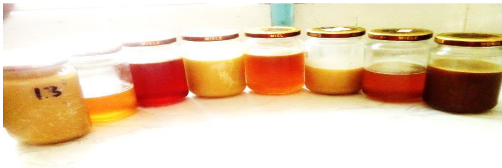
Figure1. Different honey color obtained from the study areas

The honey color shown above indicated that color of honey can be different even if it is observed from a limited area in the same honey harvesting season.