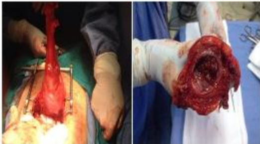
Figure 2. Intra-operative image from open partial cystectomy

Almost whole of the supratrigonal bladder was excised, and the remaining bladder was very low capacity. Therefore, the patient underwent a bladder enlargement using 15 cm of ileum in U configuration. (Figure 2)