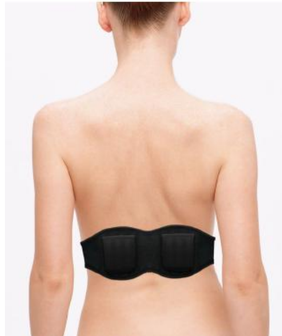
Picture2. Dr Allen's Device for kidney treatment consists of 2 thermoelements and a belt that applies these thermoelements to the projection of both kidneys.

during the prolonged period of time, for 6 months and longer, see Picture