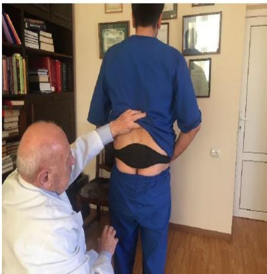
Picture1. DATD tightly attaches thermoelement to the coccyx area for a prolonged period of time.

The independent-samples t-test and paired-samples t-test are suitable only for interval and ratio data, so the Wilcoxon signed-rank test was employed. P < 0.05 was considered significant. Statistical analyses were carried out using SPSS v22 (IBM, Armonk, NY, USA).