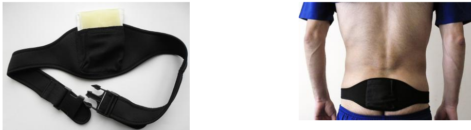
Figure1. The therapeutic device alone (on the left) and the device tightly applied to the coccyx area in the projection of the prostate.

morbidities; 10 preferred operation; 4 were suspected prostate cancer; 8 did not attend to the following examinations. Men in treatment-group were given therapeutic device, termed Dr. Allen's Device, see figure 1.