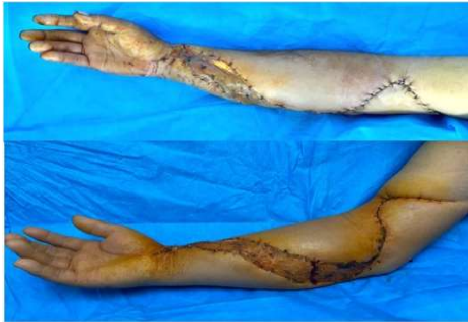
Figure 4. Postoperative photograph at 7 days, with adequate integration of the grafts, with proximal primary closure