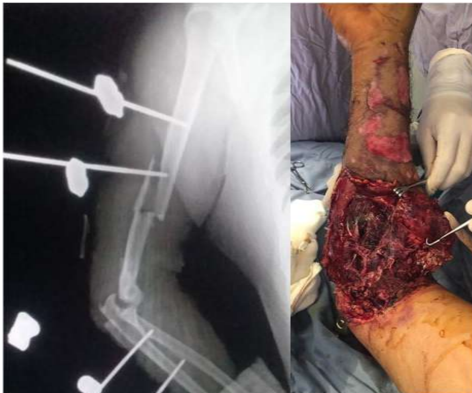
Figure5. Injury on the anteromedial surface of the arm and forearm with humerus fracture

secondary to the patency of the recurrent and collateral arteries, for which an anastomosis of the brachial artery with a cephalic vein graft was performed. However, he presented bullae on the back of the arm (Figure 6). Because of elevation of creatinine phosphokinase (CPK) up to 22,000 and lack of muscle contraction under direct stimulation in all compartments it was decided to limb amputation.