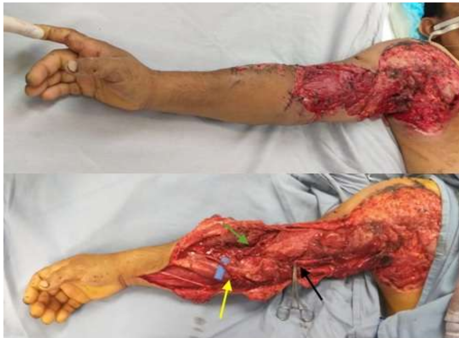
Figure 8. a) Upper: saphenous vein graft; lower: sural nerve graft. b) Anastomosis of the saphenous vein with the brachial artery at its distal and proximal end. c) Adequate venous graft perfusion. d) Sural nerve graft for the posterior interosseous nerve (green arrow). Vein graft coverage (black arrow) is observed by the latissimus dorsi muscle flap (blue arrow).

absence of a 15 cm segment of the brachial artery is observed, taking a saphenous vein graft from the left leg, taking a sural nerve graft for the posterior interosseous nerve (Figure 8); latissimus dorsi muscle flap (figure 9) to cover the bloody area, a prophylactic fasciotomy was performed on the forearm with application of a skin graft.