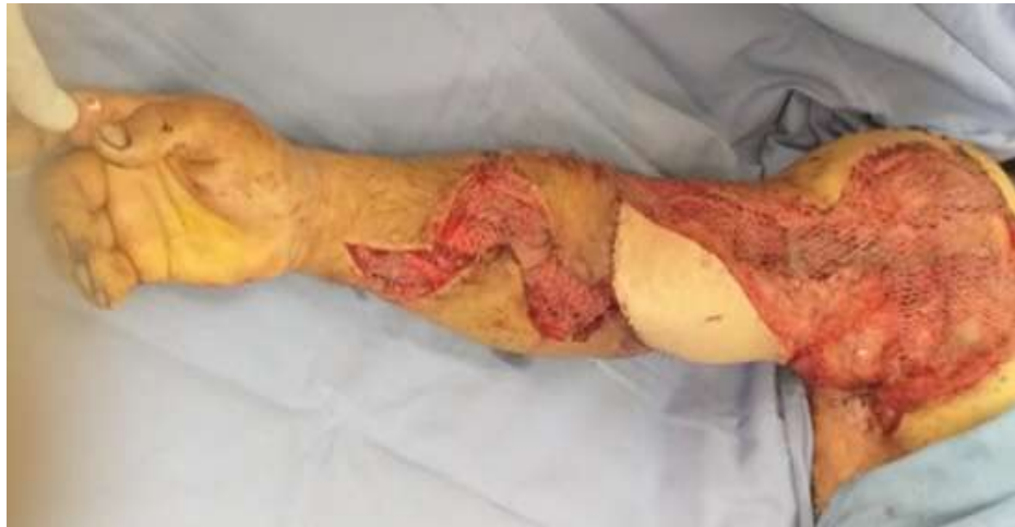
Figure9. Result. Latissimus dorsi musculocutaneous flap with cutaneous cover for anastomosis, collection, and application of intermediate partial thickness skin graft to cover the fasciotomy and bloody area