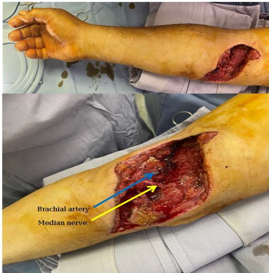
Figure2. Injury at the level of the elbow fold with section of the brachial biceps, brachial artery (blue arrow) and median nerve (yellow arrow)