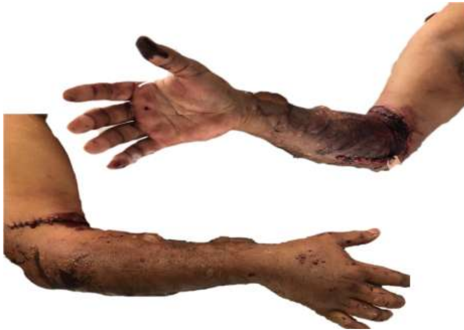
Figure 6. Ampoules are observed at the level of the arm and forearm, fasciotomies were not performed in this case