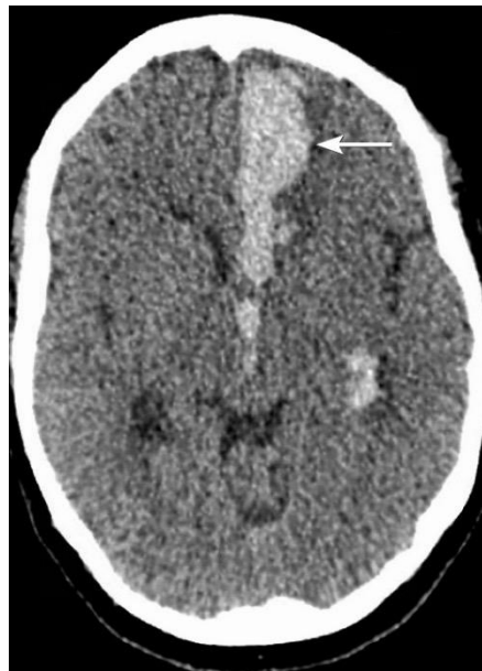
Figure1. CT brain shows subarachnoid along the interhemispheric fissure (white arrow) with extension into the third and left lateral ventricle.