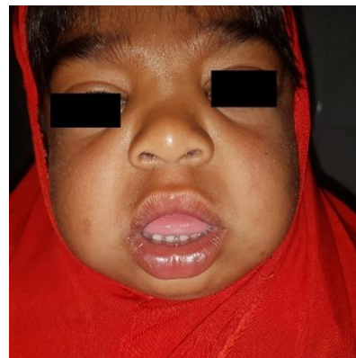
Figure 1(a). Showing broad nasal bridge, prominent orbital rims, nostril flaring and hypertelorism

both nostrils, prominent supra orbital rim bilaterally, ptosis of eye balls with ocular hypertelorism, thick eye lids and full and thick lips. Other findings included developmental delay, corneal clouding, protruding tongue, abdominal distention consistent with hepatosplenomegaly and umbilical hernia. (figure 1a, 1b)