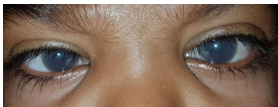
Figure 1(b). Clouding of corneas

Base line investigation showed normal TLC, platelet and retic count with low hemoglobin of 8.7mg/dl. Serum electrolytes, blood glucose levels, renal function tests and urinalysis were in normal range. Liver function tests were unremarkable except for ALP of 365 IU/L. Thyroid function tests showed low total T3 with normal TSH and free T4 levels.