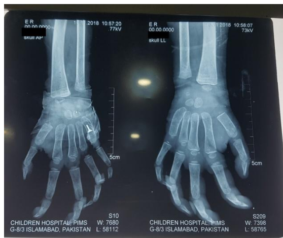
Figure 3. Hand wrist radiograph showing wide metacarpals with proximal pointing, irregular carpal bones, ulnar hypoplasia with increased joint space at radioulnar joints

Chest radiograph (PA view) showed paddle shaped ribs, shortened and thickened clavicles (figure:4). Echocardiography showed Mitral leaflet prolapse with mitral regurgitation grade II.