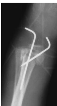
Figure3. Lateral Radiograph of an 8-Year-Old Boy with a Displaced Type 3 Fracture of the Radius Following Surgical Treatment