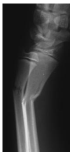
Figure1. Lateral Radiograph of a 12-Year-Old Boy Indicated an Angulated Type 1 Fracture of the Radius

Diagnosis of the types 1 to 4 fractures, not included in the Salter-Harris classification, may routinely be based on the radiographic examination (Fig. 1, 2, 3). However, a limited number of cases may necessitate evaluation using CT or MRI (Fig. 4). Treatment modalities should always focus on the principles of treatment proposed by Salter and Harris. They refer to the gentleness of reduction, the time of reduction, the method of reduction, the acceptable position of reduction and the period of immobilization [1]. This is the only secure way to avoid further damage of a disrupted physeal plate and diminish the incidence of partial or complete premature physeal arrest.