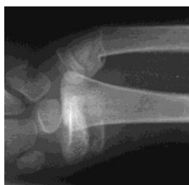
Figure2. Anteroposterior Radiograph of a 10-Year-Old Boy Indicated a Displaced Type 2 Fracture of the Radius