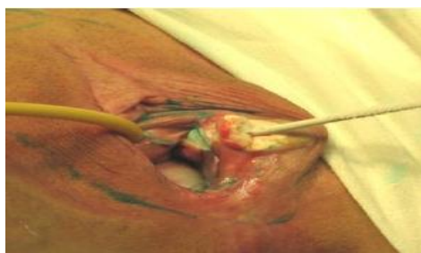
Figure3. Kriodewitalizatia of tumour

For cancer of the vulva in order to avoid dispersion of tumor cells excision is always carried out radiowave scalpel and apparatus "Harmonics" In recent years, the excision of the tumor was preceded by her credibilitate to t - 185^\circ using the apparatus ERBE, exposure 3-5 min (Figure3).