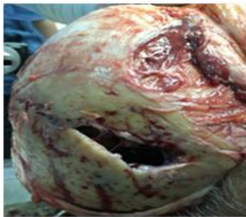
Figure1. The outside view of the right parietal bone

During autopsy, a serous fluid flowed from the right parietal region while removing the scalp and periosteum was detected. The bone defect which was 5 cm in length and the widest part of which was 2cm was observed in the right parietal bone (Figure 1). Brain, cerebellum, brain stem were weighed 1400 g. No epidural, subdural and subarachnoid hemorrhage was detected. It was determined that the dura mater and the inner lamina in the area of 6cm around the defect on the right parietal bone were destructive. In this destructive region, papillary formations with a structure different from the bone tissue were observed (Figure 2). Two cystic formations of 3cm in diameter which were connected with each other were determined on the right parietal lobe of the brain, and it was found that the arachnoid membrane lost its integrity; the cysts were associated with the subdural space (Figure 3). In basilar arteries, 50-60% occlusive atherosclerotic changes were locally seen. In the brain cross-sections, no pathological feature was observed out of edema and hyperemia. It was determined that