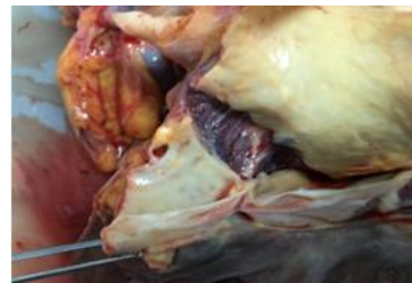
Figure4. Aortic rupture above the aortic valve

there were 800cc sero-hemorrhagic liquid in the right chest cavity and free blood around 1200cc in the pericardial cavity. The lungs were anthracotic. The heart was removed with thoracic aorta, and they were weighed as 1100gr. Up to 80% occlusive atherosclerotic changes were observed in the coronary arteries. The tricuspid valve was measured as 14.5cm, pulmonary valve as 9cm, mitral valve as 12.5cm, aortic valve as 7.5cm, left ventricular wall thickness as 2.2cm, septum as 2cm. An aneurism on the ascending aorta and 3 cm full-thickness laceration just above the aortic valve were observed (Figure4). There were common hard calcified plaques in the aorta. There were nodular changes in the liver surface and cross sections. The right kidney surface was irregular, its sections were congested, the cortex-medulla limit could not be distinguished, the left kidney was small by volume, perinephric fat tissue was increased, cysts were seen in the sections. It was concluded that the death of the person occurred as a result of cardiac tamponade due to aortic rupture.