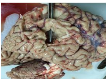
Figure3. Two connected cystic formations on the right parietal lobe

there were 800cc sero-hemorrhagic liquid in the right chest cavity and free blood around 1200cc in the pericardial cavity. The lungs were anthracotic. The heart was removed with thoracic aorta, and they were weighed as 1100gr. Up to 80% occlusive atherosclerotic changes were observed in the coronary arteries. The tricuspid valve was measured as 14.5cm, pulmonary valve as 9cm, mitral valve as 12.5cm, aortic valve as 7.5cm, left ventricular wall thickness as 2.2cm, septum as 2cm. An aneurism on the ascending aorta and 3 cm full-thickness laceration just above the aortic valve were observed (Figure4). There were common hard calcified plaques in the aorta. There were nodular changes in the liver surface and cross sections. The right kidney surface was irregular, its sections were congested, the cortex-medulla limit could not be distinguished, the left kidney was small by volume, perinephric fat tissue was increased, cysts were seen in the sections. It was concluded that the death of the person occurred as a result of cardiac tamponade due to aortic rupture.