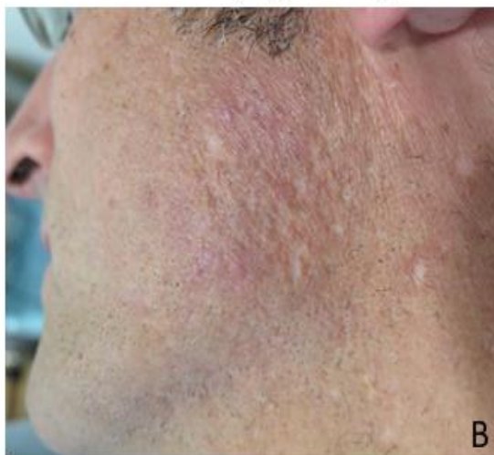
B October 2017 (last sesion May 2017)