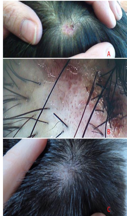
Case 2 . A .Before treatment B. Trichoscopy C . Six months after treatment

A 16-year-old man reported having had itching, crusting and erythema of the scalp for 3 years resistant to oral and topical therapies. He had a family history of hidrosadenitis and his sister with nor affiliated inflammatory lesions on the scalp. In the examination a 2x3 cm scarring alopecia patch on the vertex was observed. Trichoscopic findings include tufting, perifollicular erythema, crusts and follicular keratosis . A skin biopsy showed unspecific inflammatory changes. Laboratory results elevated levels of uric acid. The remaining parameters were within the normal range. Following the diagnosis of scarring primary alopecia type folliculitis decalvans. Nearly complete healing was seen after the same treatment regimen that case 1.(Fig 2) No relapse has occurred during a four years of follow-up.