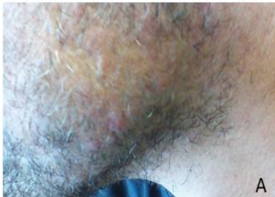
A Before treatment (August 2016)

A 38-year-old male with personal history of hidradenitis, smoking, dislipemia and acne treated with isotretinoin, presented to us with a scarring alopecia in his face. On examination an alopecic and suppurative plaque on his left cheek was observed. Histopathological study demonstrates perifolliculitis. Dissecting cellulitis was suspected. The patient improved after treatment with gluconate zinc oral and lasertherapy (4 sessions with laser Nd-YAG). (Fig 4)No relapse has occurred during three years of follow-up.