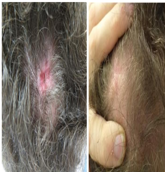
Case 1. Before treatment

diagnosed dissecting cellulitis and the patient was treated with a 6-month course of gluconate zinc 70 mg daily and laser therapies. A total of 10 treatments in an 2 week inter-treatment interval, with long-pulsed Nd:YAG 1064-nm laser, 3,5 and 10 –mm spot size, the energy density from 50 jul/cm 2 to 150 jul/ cm 2 , and pulse duration between 20 to 30 ms. The therapeutic result was very good with remission of the inflammation and partial recovering of hair. (Fig 1) As maintenance therapy, he is being treated with gluconate zinc 6 months a year. During the next 4 years no recurrence has been observed