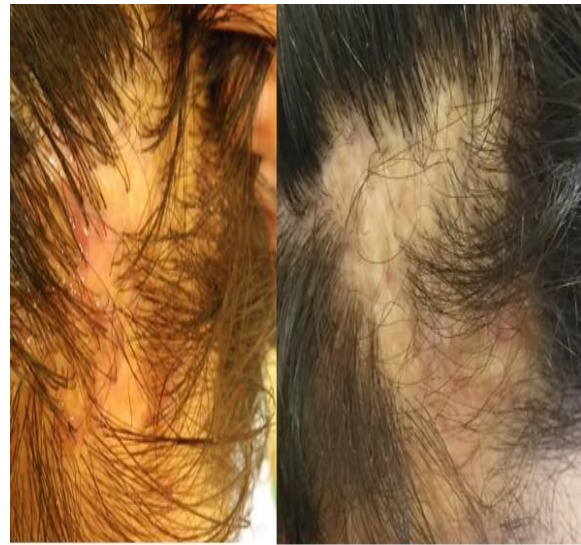
Case 5. Before treatment (Nov 2018)

A 29-year-old male was referred to our department because a patch of localized alopecia in his occipital region. A histopathoholigal study showed histological features consistent with folliculitis decalvans. He has been successfully treated with oral gluconate zinc 70 mg daily (6 months a year) combined with Nd:YAG laser (the same treatment regimen that case 1) without relapse after 7 months of follow up. (Fig 5)