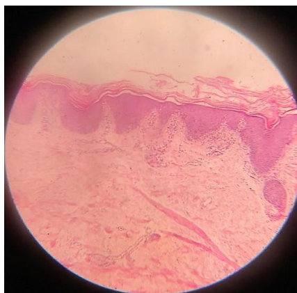
Figure5. Same slide as in figure 4 in 10*10x view wherein the hyperkeratosis and papillomatosis is more clearly visible. Acanthosis and lymphocytic infiltrates in the papillary dermis are also seen.