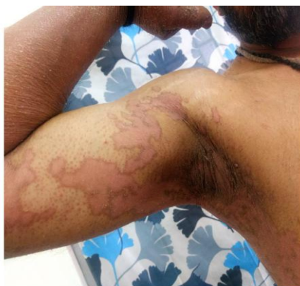
Figure3. Erythematous scaly plaques are seen over the right arm and axilla. Note the erythematous to pigmented border and the tiny white pityriasiform scaling.