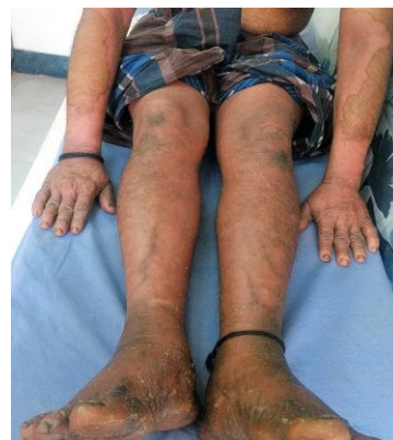
Figure2. Erythematous scaly plaques are seen over the bilateral extremities along with plantar keratoderma. Pigmentation is seen over the bilateral knees. Paronychia along with nail thickening is also visible.