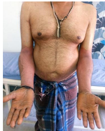
Figure1. Erythematous scaly well-defined plaques over the bilateral forearms and lower abdomen is seen along with palmar keratoderma.