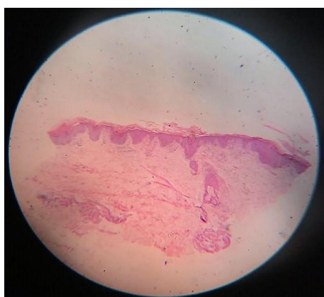
Figure4. Formalin fixed, H&E stained section of skin from the right forearm seen under scanning view showing hyperkeratosis and papillomatosis.