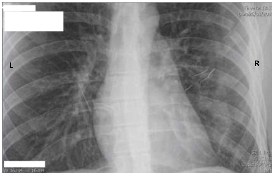
Figure 1. Patient's X-Ray shows the number of needles embedded in the anterior chest wall. Two can be seen embedded in the left anterior thorax and four were seen in the right thorax