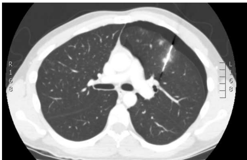
Figure 2. Further CT scan shows one of the needles embedded in the left lung close to the pulmonary artery