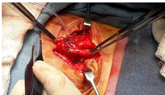
Fig3. End / oblique anastomosis