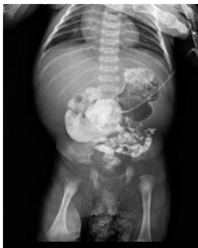
Fig4. Intestinal transit series with contrast medium

Once again, intestinal transit was performed, where the contrast medium of the stomach was passed to the colon and patency of the anastomosis was observed. (Figure 4) gastrostomy tube feeding was started with amino acid formula and fed to the mother's breast presenting a scarce evacuation on the second day of feeding.