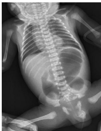
Fig1. Abdominal radiograph showing a triple bubble image with suspicion of intestinal atresia

It is covered with double antimicrobial scheme with cefotaxime and ampicillin at renal dose. A radiograph of the abdomen is requested, which shows a triple bubble image with suspicion of intestinal atresia, (fig. 1) evaluation by pediatric surgery is requested.